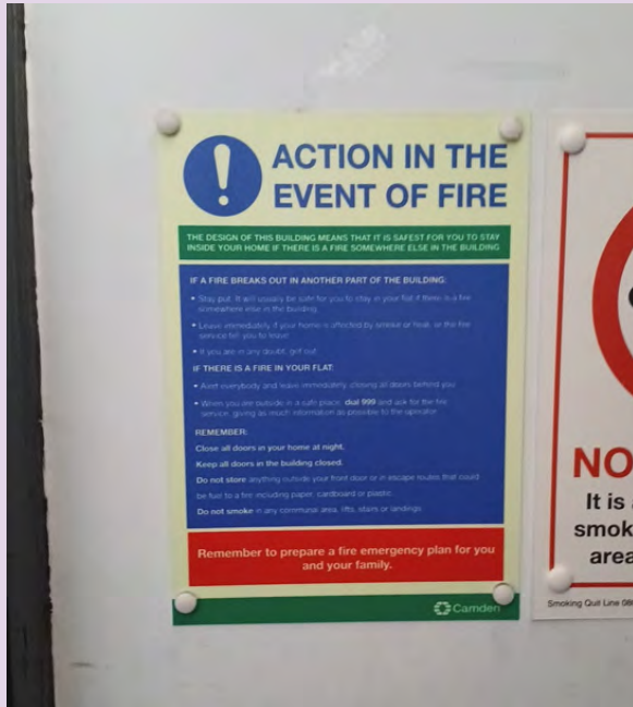
Fire Action Notice at Tavistock Mansions, Flats 3-12, 16 Tavistock Place.

We have installed Fire Action Notices in your building.