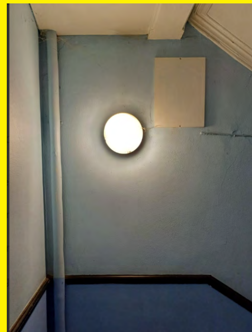
Emergency lighting at Tavistock Mansions, Flats 3-12, 16 Tavistock Place.

Emergency lighting provides illumination in instances where mains power may have failed. It illuminates escape routes, emergency exit/s and firefighting equipment. It will provide illumination to signage and provide sufficient lighting to help you to escape.