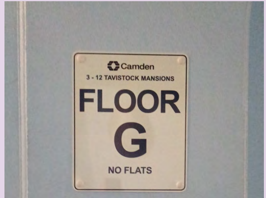
Wayfinding signage at Tavistock Mansions, Flats 3-12, 16 Tavistock Place

Wayfinding signage is a visual communication tool to assist the Fire and Rescue Service in locating specific flats as they navigate their way round a building.