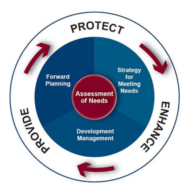
Figure 1: Sport England Strategic Planning Model

This Strategy seeks to provide all partners and stakeholders in Camden with a valuable tool that guides internal and external investment decisions, supports applications for external funding and informs key management decisions.