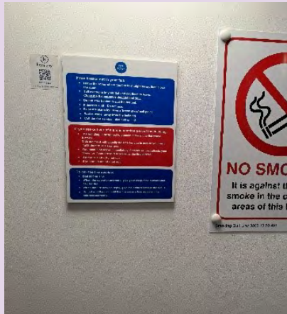
Fire Action Notice and Fire Exit Sign at Flats 1- 21, 2 Vicars Road.

We have installed Fire Action Notices and Fire Exit Signs in your building.