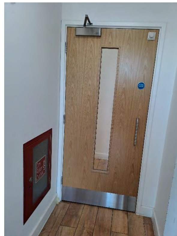
Communal area fire door at Flats 1- 21, 2 Vicars Road.