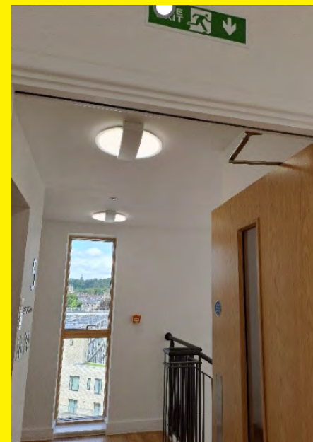
Emergency lighting at Flats 1- 21, 2 Vicars Road.

An emergency lighting system is generally comprised of self-contained 3hr battery back-up-maintained LED luminaires. The lighting should illuminate all escape routes, emergency exit/s and firefighting equipment. Emergency lighting is installed throughout the block, in all lobbies and at each level of the stairwell. They are located at each emergency escape exit point.