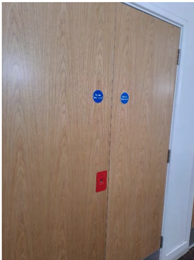
Fire door on cupboard at Flats 1- 21, 2 Vicars Road.

Doors to plant rooms, electrical intake and lift motor rooms (including fire rated hatches or panels)