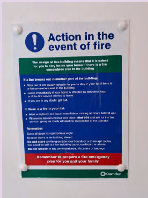
Fire Action Notice in at 9A York Way.

We have installed Fire Action Notices and Fire Exit Signs in your building.