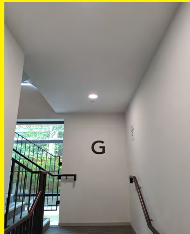
Stairwell emergency lighting at 9C York Way.

The lighting should illuminate all escape routes, emergency exit/s and firefighting equipment.