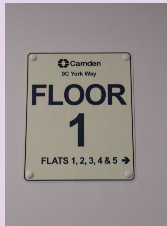
First floor wayfinding signage at 9C York Way.

Wayfinding signage is a visual communication tool to assist the Fire and Rescue Service in locating specific flats as they navigate their way round a building.