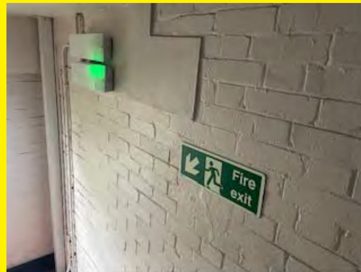
Emergency lighting at 81-92 Primrose Hill Court.

Emergency lighting provides illumination in instances where mains power may have failed. It illuminates escape routes, emergency exit/s and firefighting equipment. It will provide illumination to signage and provide sufficient lighting to help you to escape.