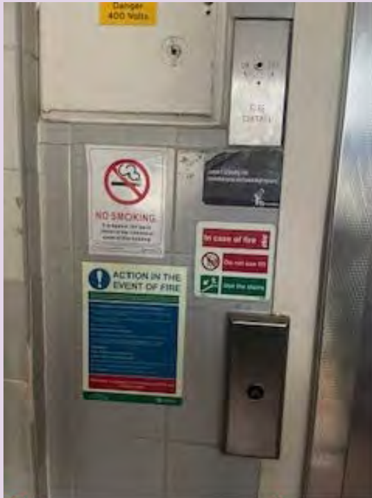
Fire Action Notice at 81-92 Primrose Hill Court.

We have installed Fire Action Notices and Fire Exit Signs in your building.