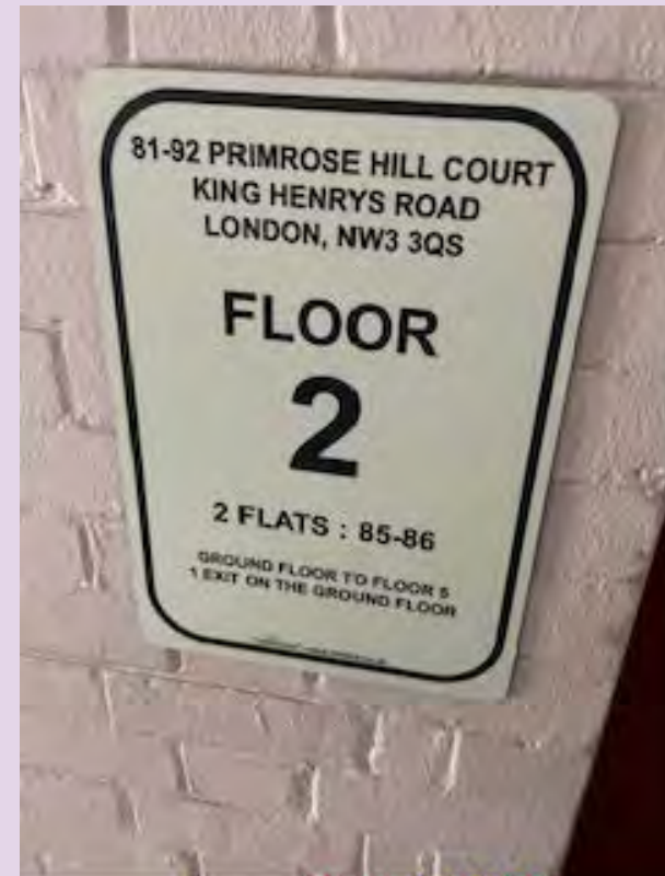
Wayfinding signage at 81-92 Primrose Hill Court.

Wayfinding signage is a visual communication tool to assist the Fire and Rescue Service in locating specific flats as they navigate their way round a building.