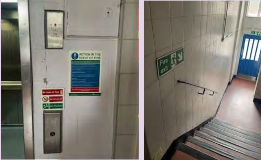
Fire Action notices and Fire Exit signage at 69-80 Primrose Hill Court.

We have installed Fire Action Notices and Fire Exit Signs in your building.