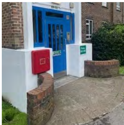
Secure Information Box at 69-80 Primrose Hill Court

If you need help in the event of an emergency such as a fire, due to a physical disability or long term medical condition or another disorder, please let us know.