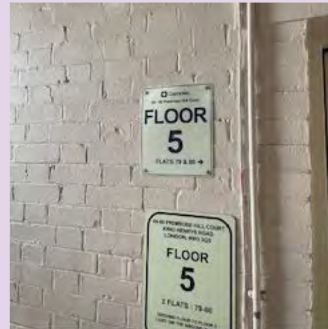
Wayfinding signage at 69-80 Primrose Hill Court.

Wayfinding signage is a visual communication tool to assist the Fire and Rescue Service in locating specific flats as they navigate their way round a building.