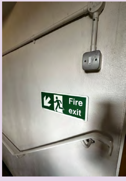
Fire Action Notice and Fire Exit Sign at 50 Britannia Street.