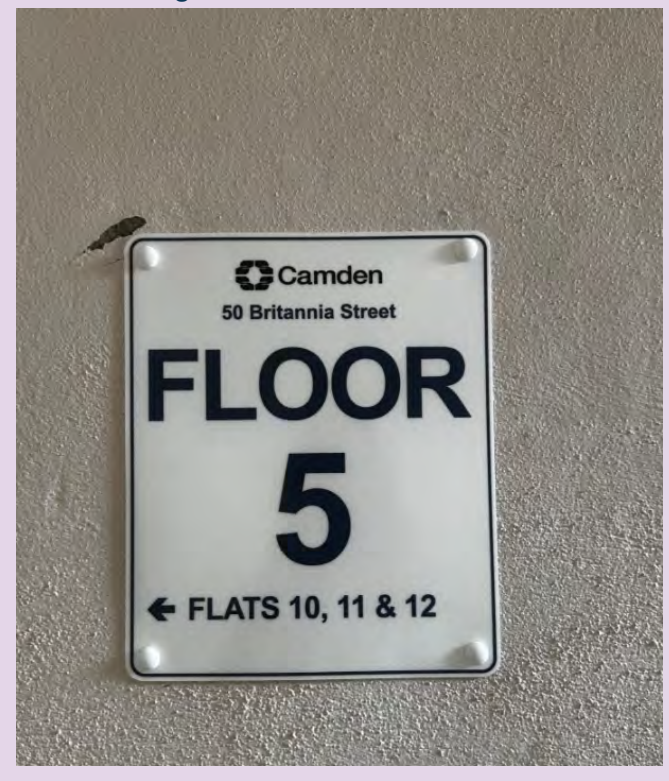
Wayfinding signage at 50 Britannia Street.

Wayfinding signage is a visual communication tool to assist the Fire and Rescue Service in locating specific flats as they navigate their way round a building.