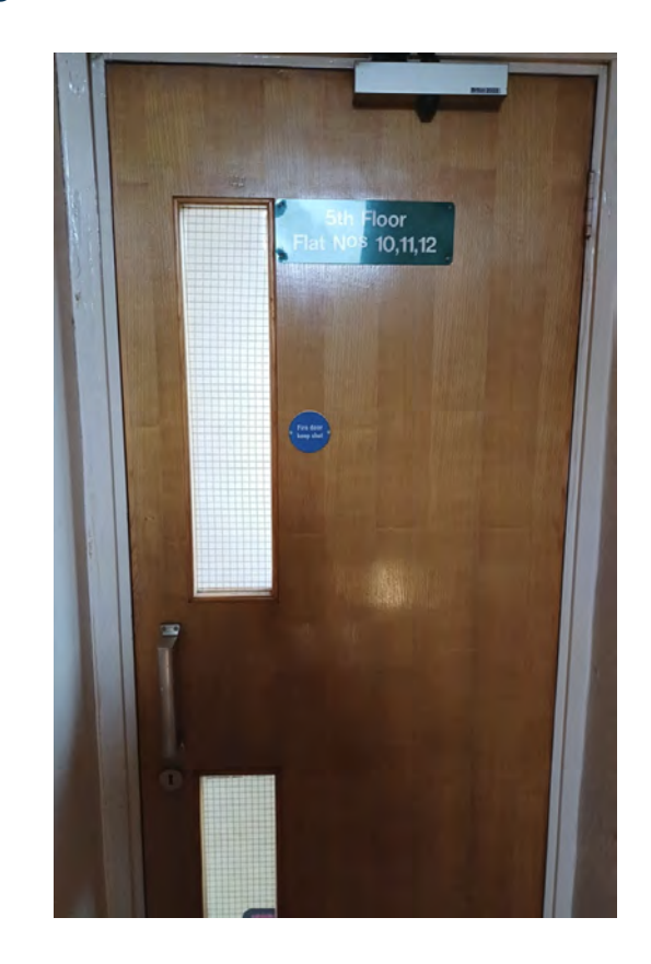
Communal fire door at 50 Britannia Street.