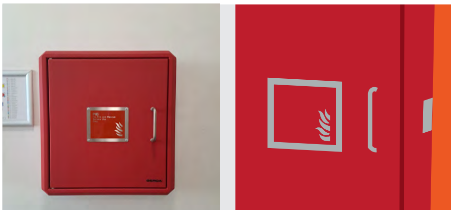
Secure Information Box at Great Russell Mansions.

Secure Information Boxes are easily identifiable storage units for documents intended for use by the fire and rescue service during a fire.