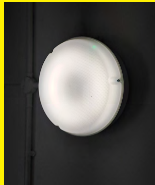
Emergency lighting at Great Russell Mansions.

An emergency lighting system is generally comprised of self-contained 3hr battery back-up-maintained LED luminaires. The lighting should illuminate all escape routes, emergency exit/s and firefighting equipment.