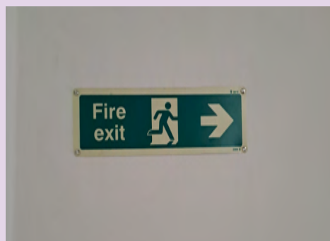
A Fire Action Notice and Fire Exit Sign at Great Russell Mansions.