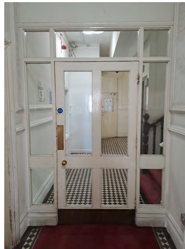
Communal Fire Door at Great Russell Mansions