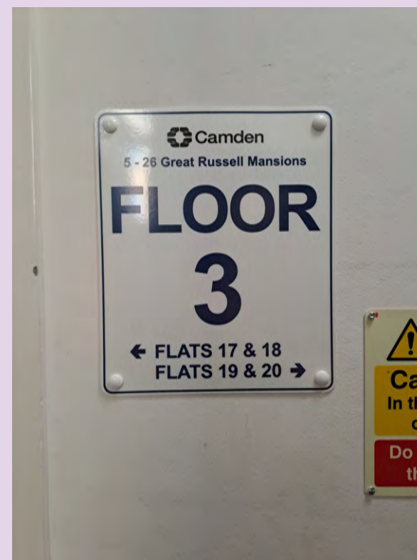
Third floor wayfinding signage at Great Russell Mansions

Wayfinding signage is a visual communication tool to assist the Fire and Rescue Service in locating specific flats as they navigate their way round a building.