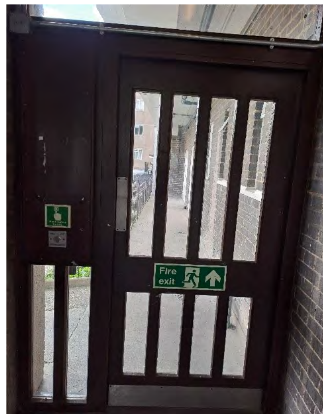
Emergency ground floor exit at Templar.