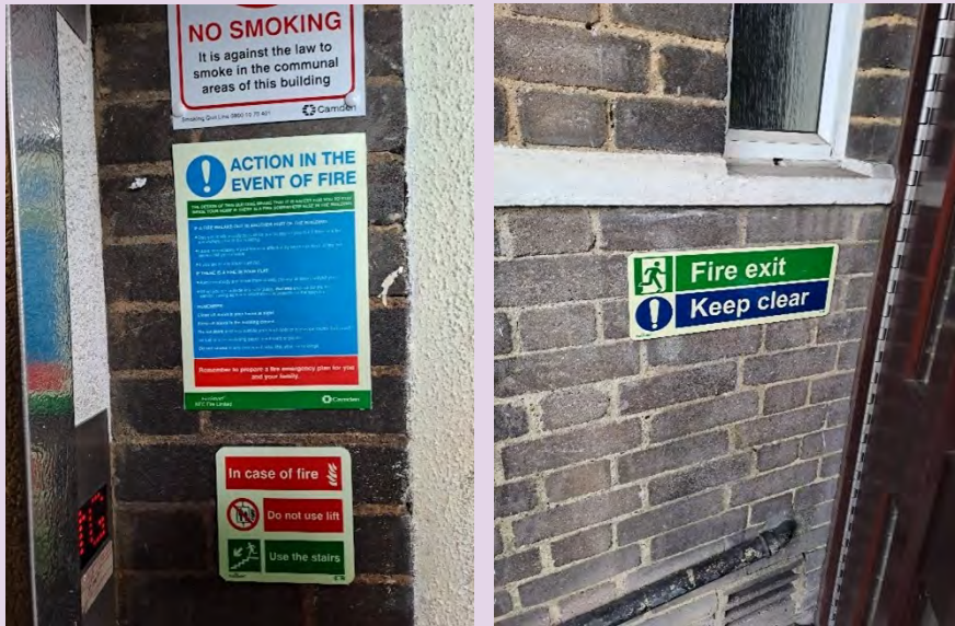
Fire Action Notice and Fire Exit signage at Templar House.

We have installed Fire Action Notices and Fire exit signs in your building.