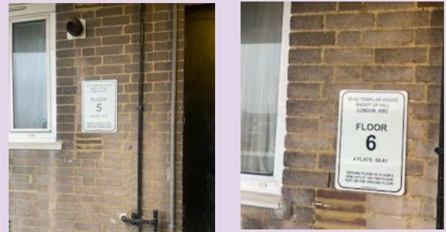
Wayfinding signage at Templar House.

Wayfinding signage is a visual communication tool to assist the Fire and Rescue Service in locating specific flats as they navigate their way round a building.