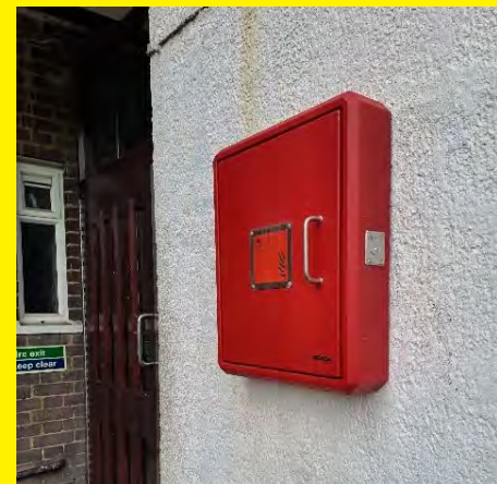
Secure Information Box at Templar.

Your flat number and floor number information will be stored in the secure premises information box, which the London Fire Brigade will access in an emergency, so they know you need help and are able to support you. We may contact you about an emergency plan or request your consent to refer you to the most appropriate council service.