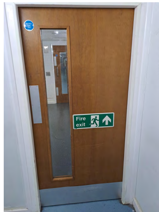
Communal Fire Door at Grafton Way.