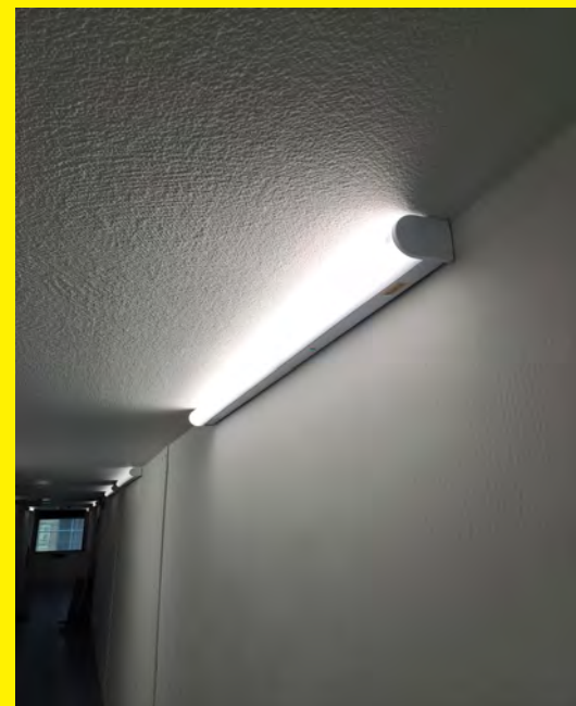
Emergency lighting at Grafton Way

Emergency lighting provides illumination in instances where mains power may have failed. It illuminates escape routes, emergency exit/s and firefighting equipment. It will provide illumination to signage and provide sufficient lighting to help you to escape.