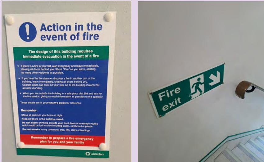
Fire Action Notice at Grafton Way

We have installed Fire Action Notices and Fire Exit Signs in your building.