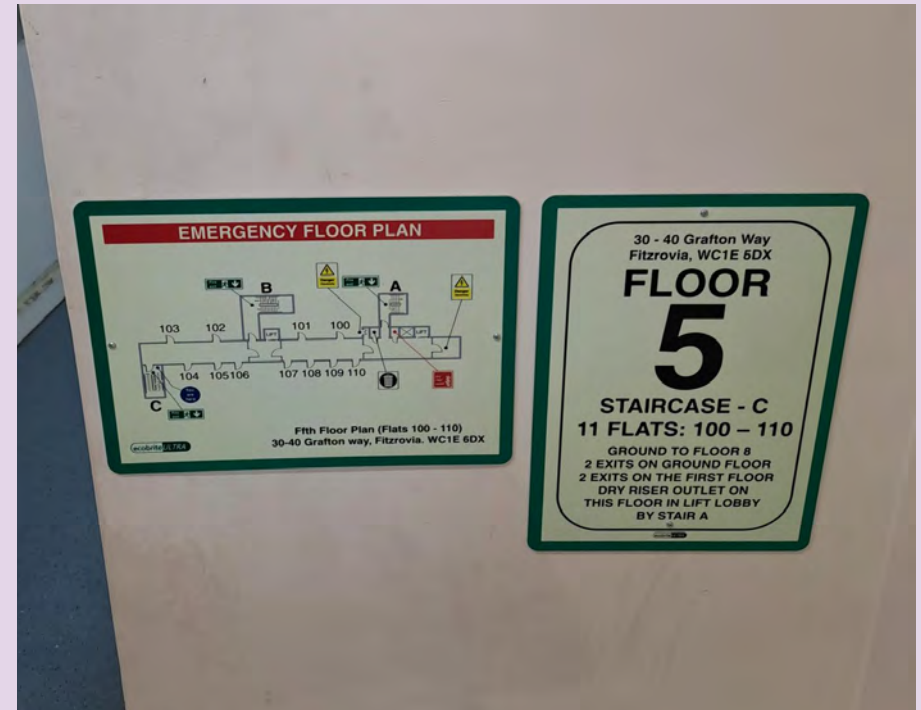
Wayfinding signage at Grafton Way.

Wayfinding signage is a visual communication tool to assist the Fire and Rescue Service in locating specific flats as they navigate their way round a building.