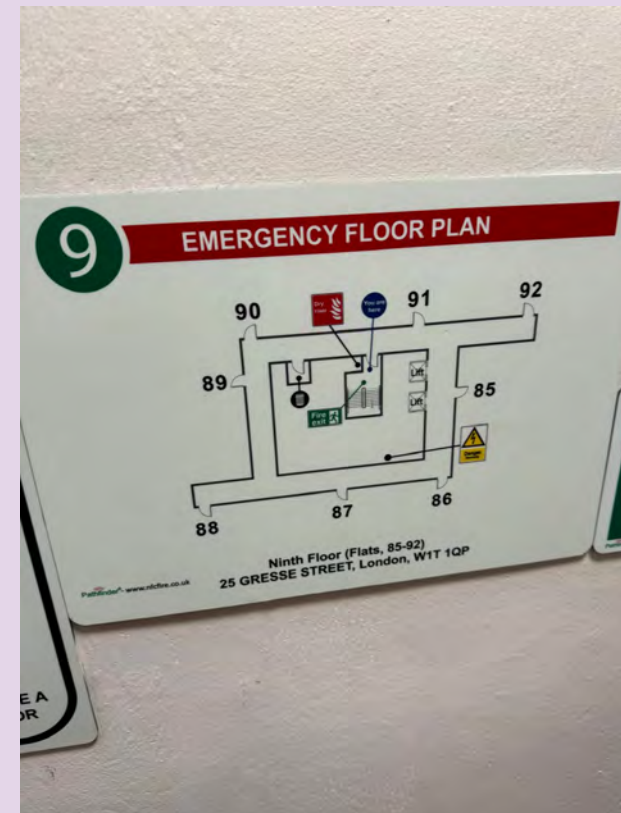
Wayfinding signage at 25 Gresse Street.

Wayfinding signage is a visual communication tool to assist the Fire and Rescue Service in locating specific flats as they navigate their way round a building.