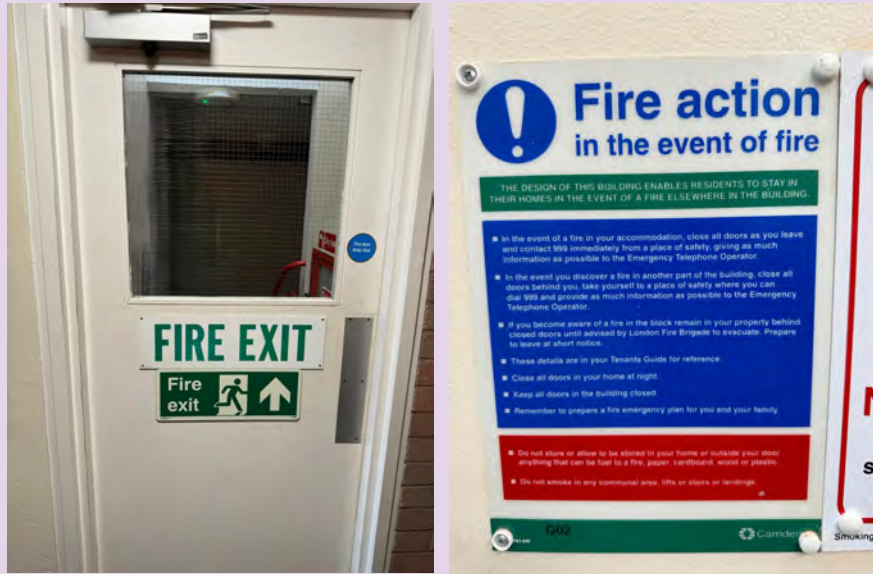
Fire Action Notice and Fire Action Notice at 25 Gresse Street.

We have installed Fire Action Notices and Fire Exit Signs in your building.