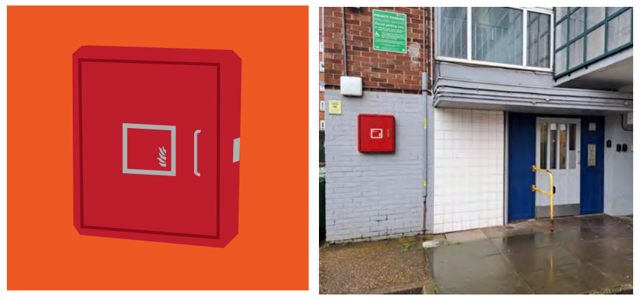
Secure Information Box at Castle Court.

Secure Information Boxes are easily identifiable storage units for documents intended for use by the fire and rescue service during a fire.