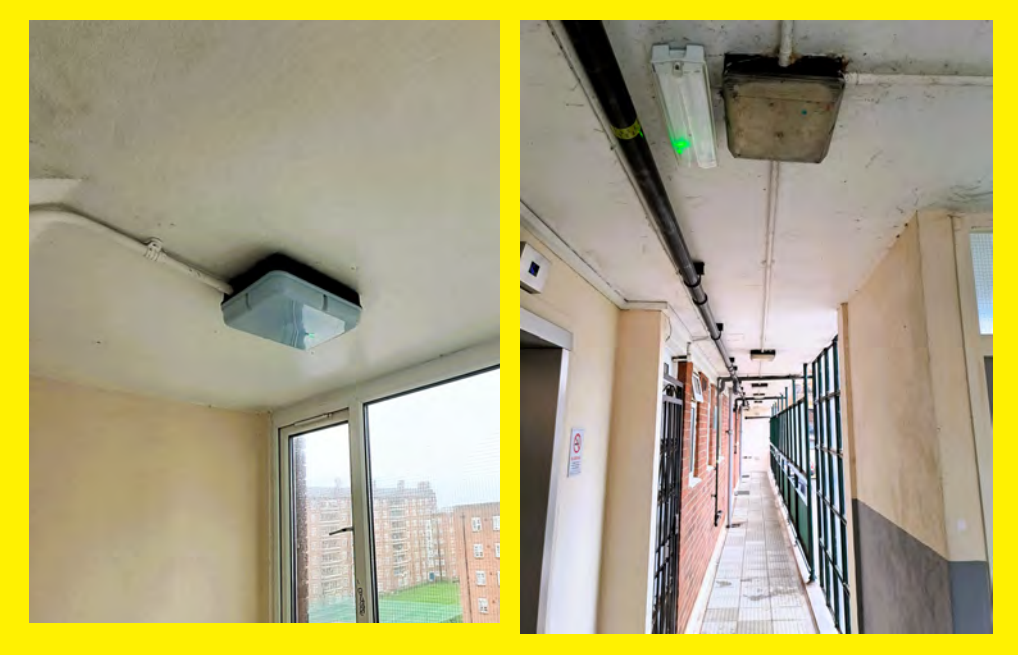
Internal and external emergency lighting at Castle Court.

The lighting should illuminate all escape routes, emergency exit/s and firefighting equipment.