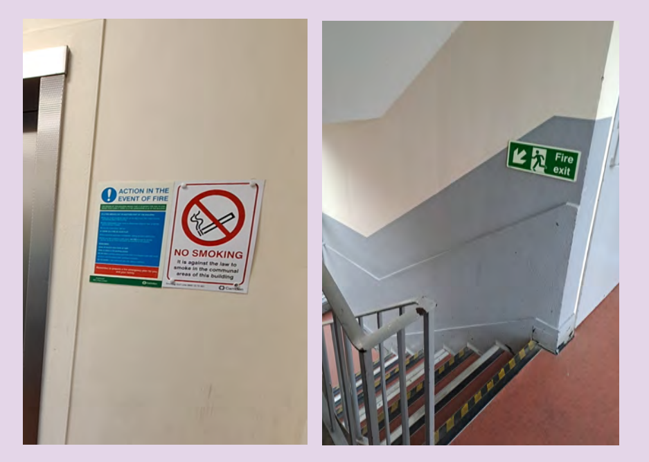
Fire Action Notices and Fire Exit Sign at Castle Court.

We have installed Fire Action Notices and Fire Exit Signs in your building.