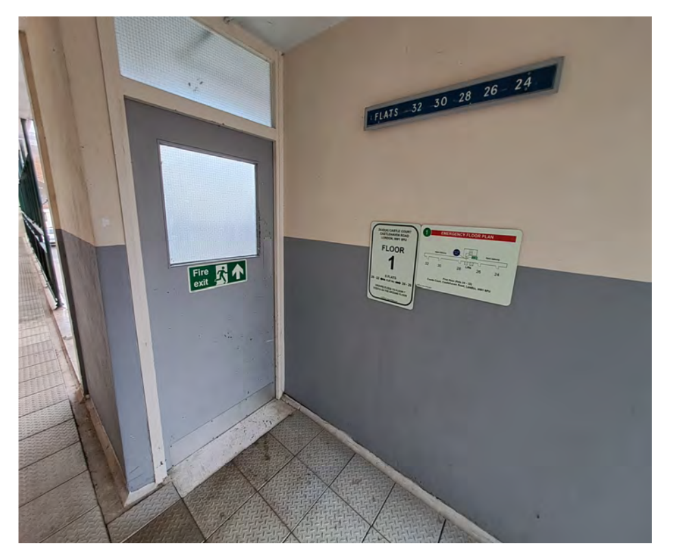
Communal fire door at Castle Court.