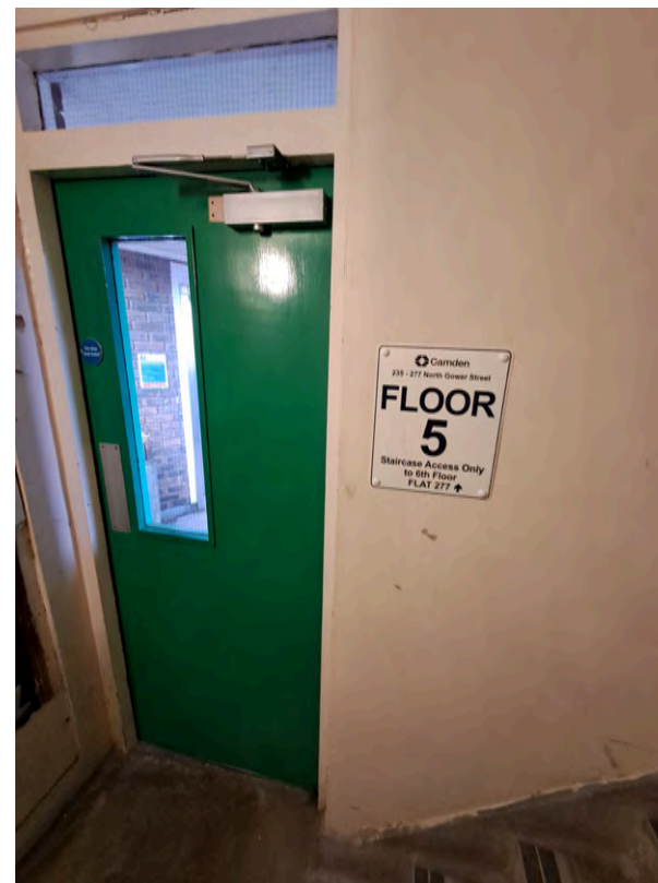
Communal Fire Door at 235-277 North Gower Street