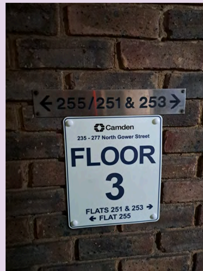
Wayfinding signage at 235-277 North Gower Street

Wayfinding signage is a visual communication tool to assist the Fire and Rescue Service in locating specific flats as they navigate their way round a building.