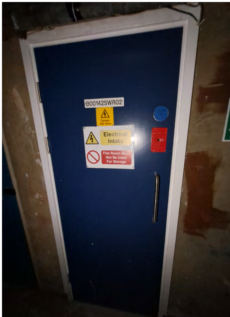
Electrical Intake Room Fire Door at 23-44 Rydal Water .

Doors to plant rooms, electrical intake and lift motor rooms (including fire rated hatches or panels)