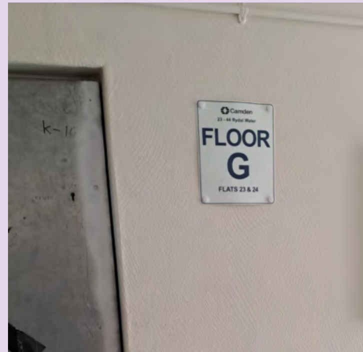
Wayfinding signage at 23-44 Rydal Water.

Wayfinding signage is a visual communication tool to assist the Fire and Rescue Service in locating specific flats as they navigate their way round a building.