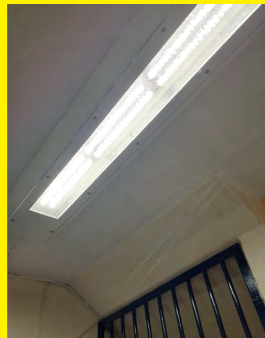
Emergency lighting at 23-44 Rydal Water.

Emergency lighting provides illumination in instances where mains power may have failed. It illuminates escape routes, emergency exit/s and firefighting equipment. It will provide illumination to signage and provide sufficient lighting to help you to escape.