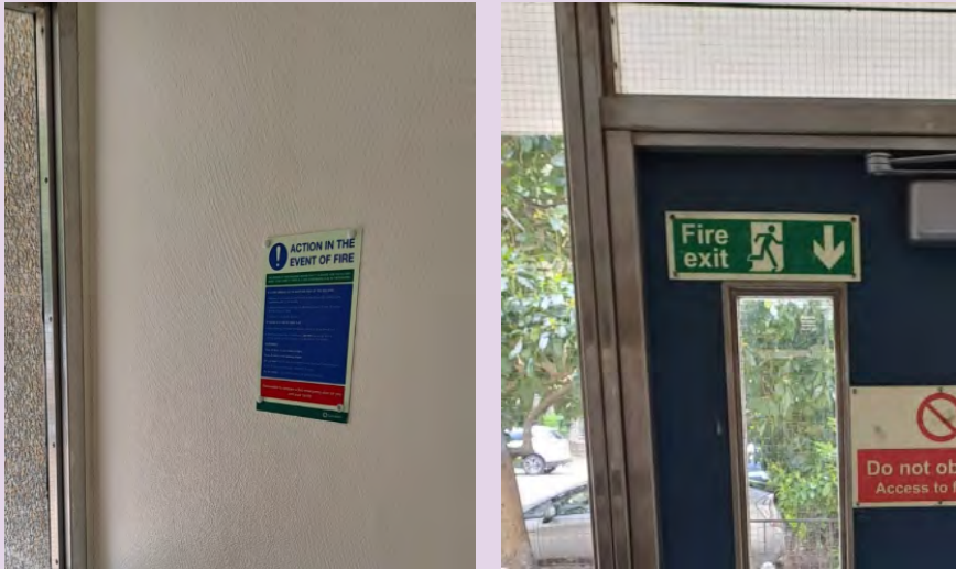
Fire Action Notice and Fire Exit Sign at 23-44 Rydal Water.

We have installed Fire Action Notices and Fire Exit Signs in your building.