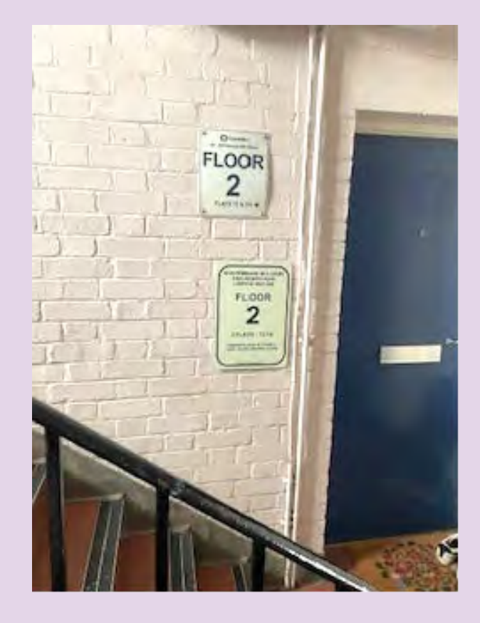
Wayfinding Signage at 23-34 Primrose Hill Court.

Wayfinding signage is a visual communication tool to assist the Fire and Rescue Service in locating specific flats as they navigate their way round a building.