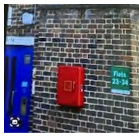
Secure Information Box at 23-34 Primrose Hill Court.

If you need help in the event of an emergency such as a fire, due to a physical disability or long term medical condition or another disorder, please let us know.