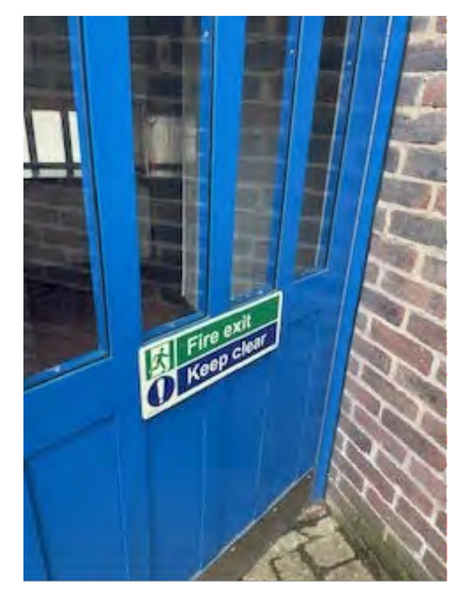
Fire door with fire exit sign at 23-34 Primrose Hill Court.