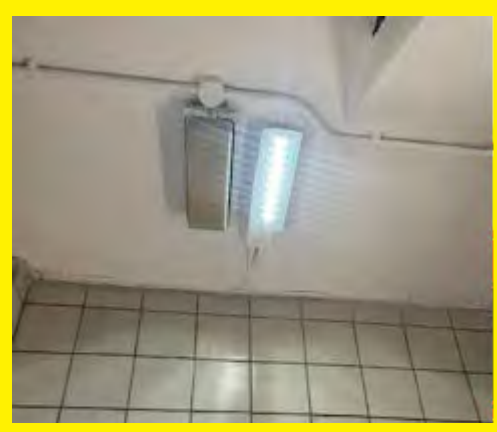
Emergency lights at 23-34 Primrose Hill Court.

An emergency lighting system is generally comprised of selfcontained 3hr battery back-up-maintained LED luminaires. The lighting should illuminate all escape routes, emergency exit/s and firefighting equipment.