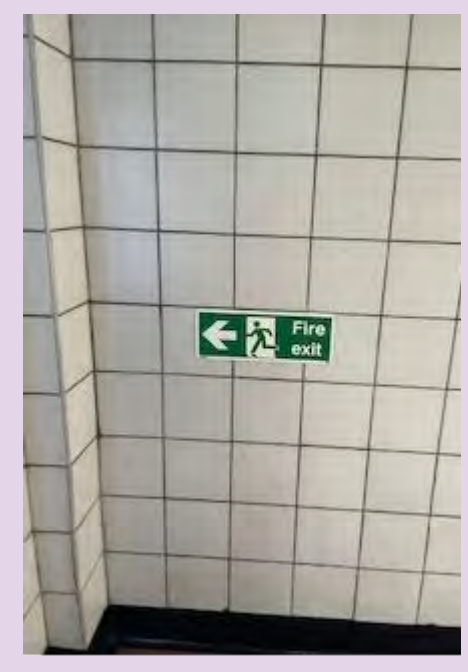
Fire Action Notices and Fire Exit Signs at 23-34 Primrose Hill Court.