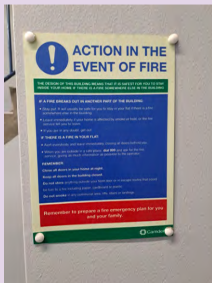
Fire Action Notice at 2 Greville Street.

We have installed Fire Action Notices and Fire Exit Signs in your building.