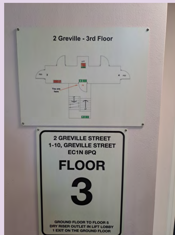
Wayfinding signage at 2 Greville Street.

Wayfinding signage is a visual communication tool to assist the Fire and Rescue Service in locating specific flats as they navigate their way round a building.