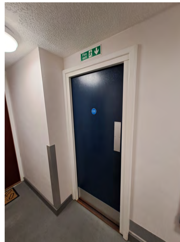
Fire door leading to stairwell at 2 Greville Street.