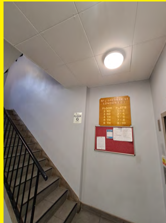
Emergency lighting in stairwell at 2 Greville Street.

Emergency lighting provides illumination in instances where mains power may have failed. It illuminates escape routes, emergency exit/s and firefighting equipment. It will provide illumination to signage and provide sufficient lighting to help you to escape.