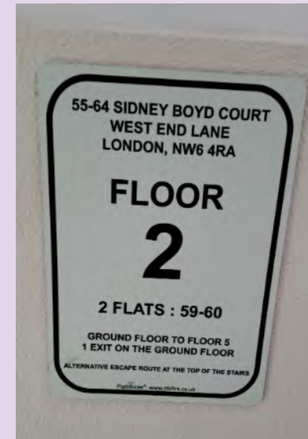
Wayfinding signage at Sidney Boyd Court.

Wayfinding signage is a visual communication tool to assist the Fire and Rescue Service in locating specific flats as they navigate their way round a building.