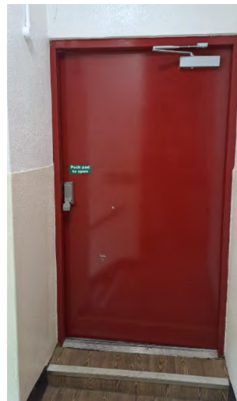
Cross connection Fire Door at Sidney Boyd Court