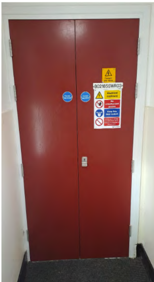
Electrical Intake Cupboard Fire Door at Sidney Boyd Court.

Doors to plant rooms, electrical intake and lift motor rooms (including fire rated hatches or panels)