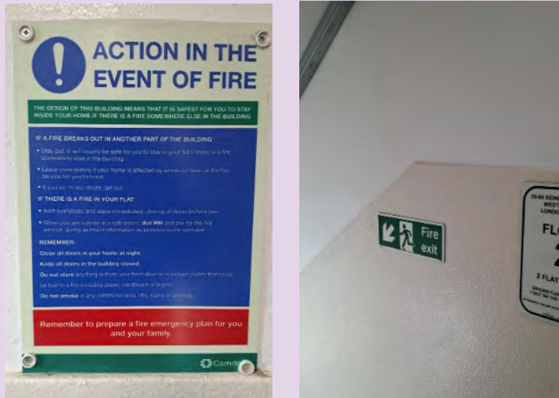
Fire Action Notice and Fire Exit Sign at Sidney Boyd Court.

We have installed Fire Action Notices and Fire Exit Signs in your building.