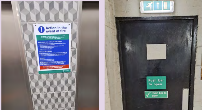
Fire Action Notice and Fire Exit Sign at 11-84 Medway Court.

We have installed Fire Action Notices and Fire Exit Signs in your building.