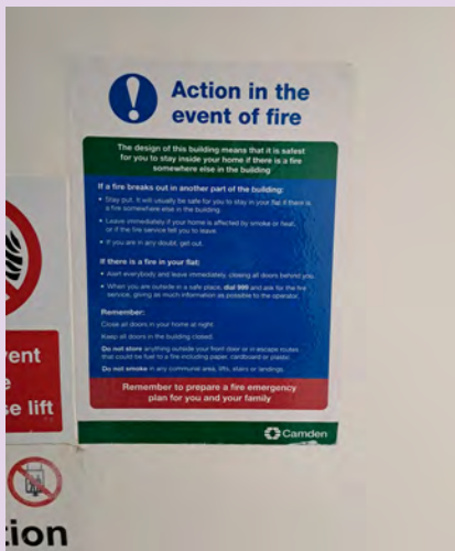
Fire Action Notice at Denton.

We have installed Fire Action Notices and Fire Exit Signs in your building.