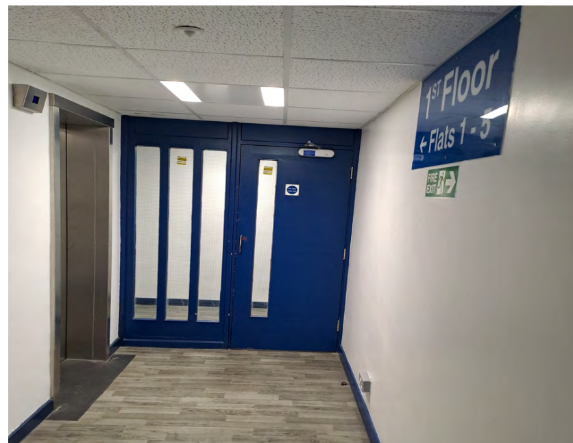
Communal Fire Door at Denton.