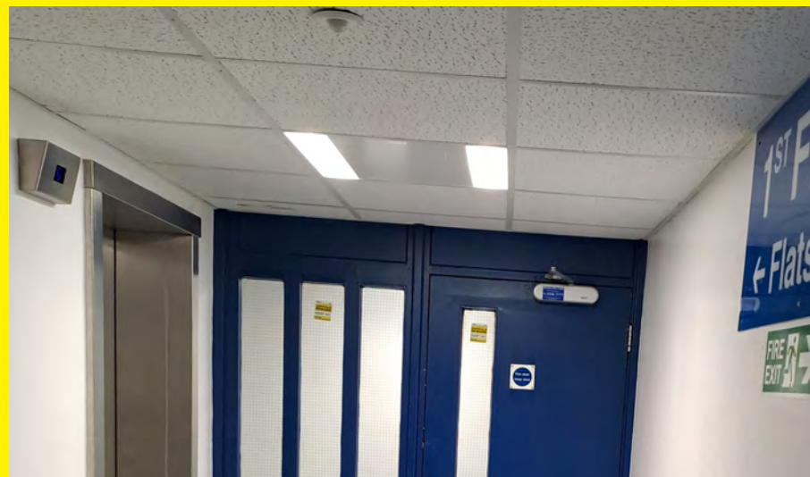
Emergency lighting at Denton.

Emergency lighting provides illumination in instances where mains power may have failed. It illuminates escape routes, emergency exit/s and firefighting equipment. It will provide illumination to signage and provide sufficient lighting to help you to escape.