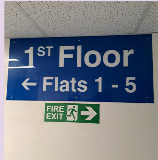
Wayfinding signage at Denton.

Wayfinding signage is a visual communication tool to assist the Fire and Rescue Service in locating specific flats as they navigate their way round a building.