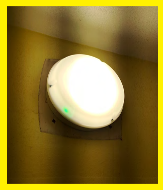
Emergency lighting at Dalehead.

The lighting should illuminate all escape routes, emergency exit/s and firefighting equipment.