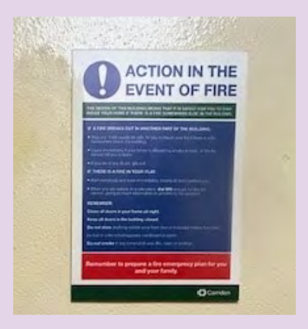
Fire Action Notice at Dalehead.

We have installed Fire Action Notices and Fire Exit Signs in your building.