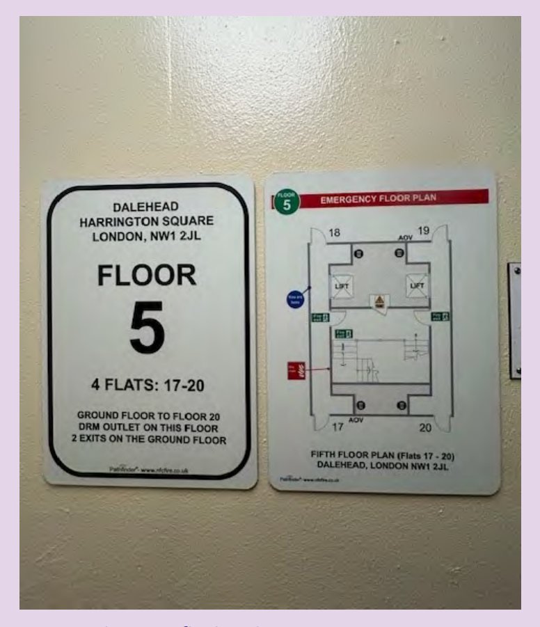
Various wayfinding signage at Dalehead.

Wayfinding signage is a visual communication tool to assist the Fire and Rescue Service in locating specific flats as they navigate their way round a building.