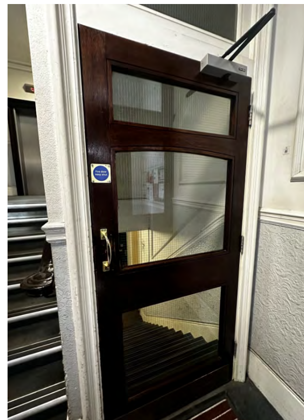
Communal Fire Door at Gordon Mansions.