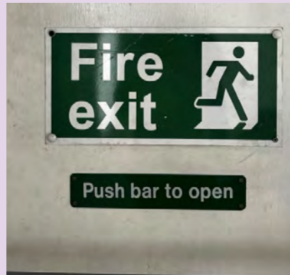
Fire Action Notice and Fire Exit Sign at Gordon Mansions.