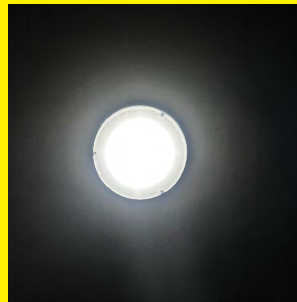
Emergency lighting at Gordon Mansions.

Emergency lighting provides illumination in instances where mains power may have failed. It illuminates escape routes, emergency exit/s and firefighting equipment. It will provide illumination to signage and provide sufficient lighting to help you to escape.