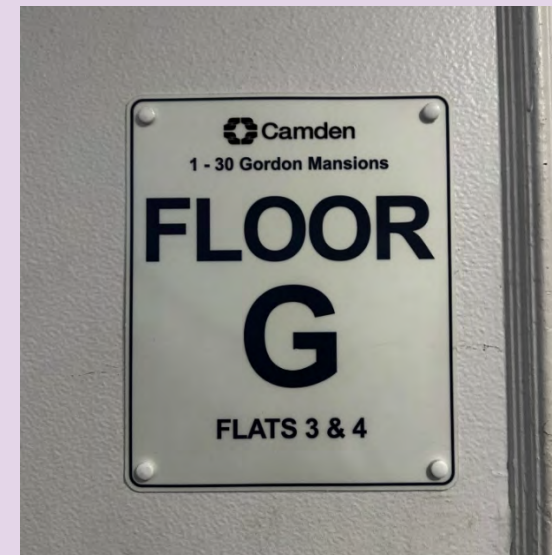
Wayfinding signage at Gordon Mansions.

Wayfinding signage is a visual communication tool to assist the Fire and Rescue Service in locating specific flats as they navigate their way round a building.