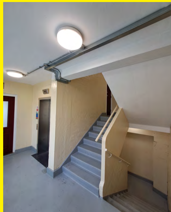
Emergency lighting at Park View House

Emergency lighting provides illumination in instances where mains power may have failed. It illuminates escape routes, emergency exit/s and firefighting equipment. It will provide illumination to signage and provide sufficient lighting to help you to escape.