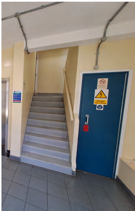
Electrical cupboard fire door at Park View House.