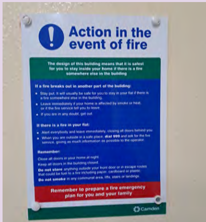
Fire Action Notice beside lift at Park View House.

We have installed Fire Action Notices in your building.