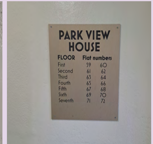
Various wayfinding signage at Park View House.

Wayfinding signage is located on each stairwell landing and by the main entrance.