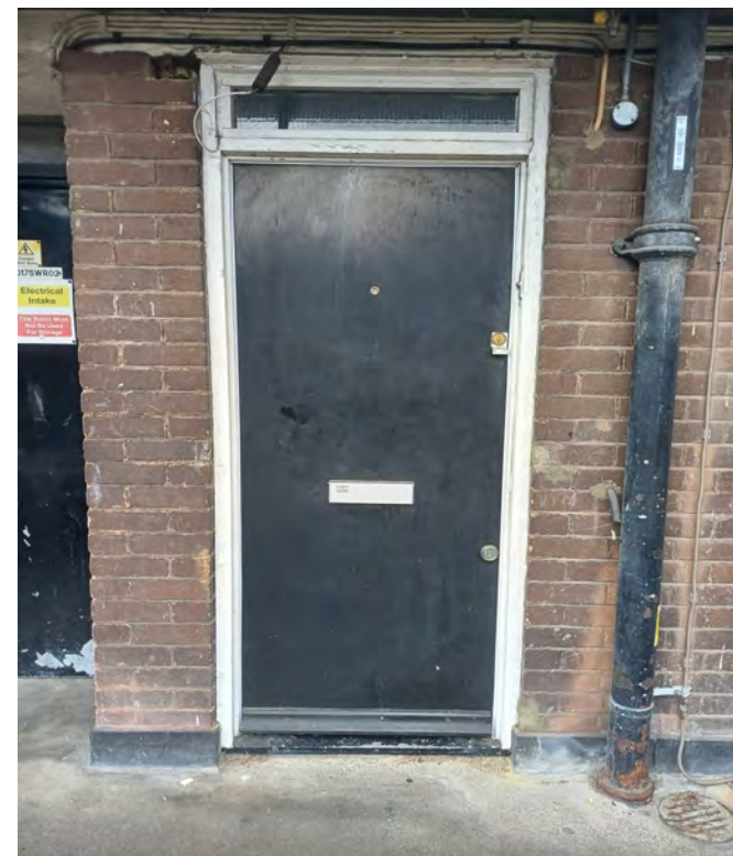
Front Entrance Door at Fairfield.