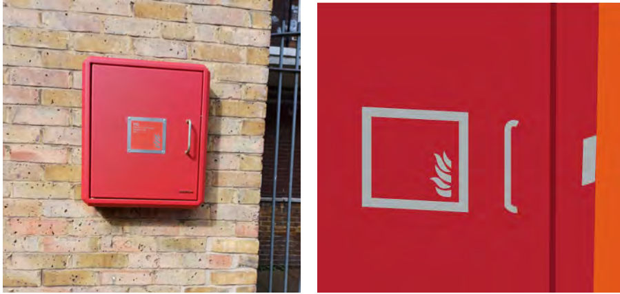
Secure Information Box at Fairfield.

Secure Information Boxes are easily identifiable storage units for documents intended for use by the fire and rescue service during a fire.