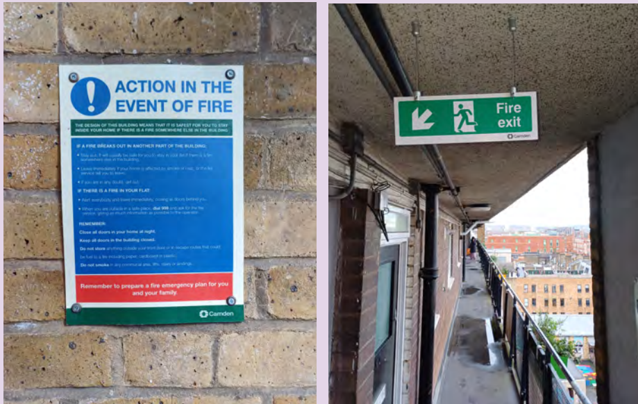
Fire Action Notice and Fire Exit Signs at Fairfield.

We have installed Fire Action Notices and Fire Exit Signs in your building.