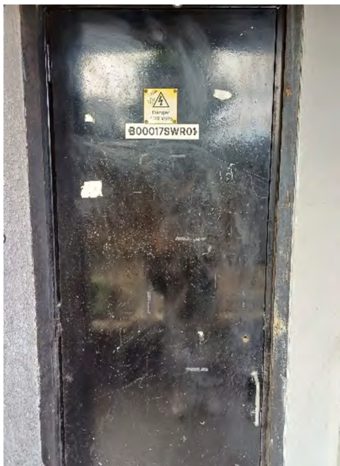
Electrical Intake cupboard Fire Door at Fairfield.

Doors to plant rooms, electrical intake and lift motor rooms (including fire rated hatches or panels)