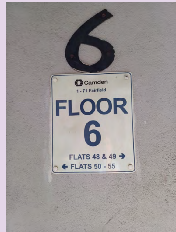
Wayfinding signage at Fairfield.

Wayfinding signage is a visual communication tool to assist the Fire and Rescue Service in locating specific flats as they navigate their way round a building.