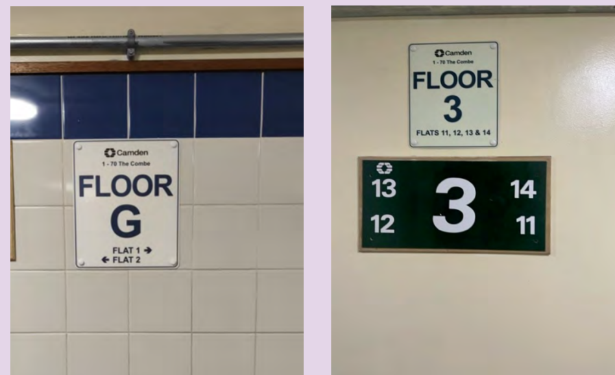
Wayfinding signage at The Combe.

Wayfinding signage is a visual communication tool to assist the Fire and Rescue Service in locating specific flats as they navigate their way round a building.