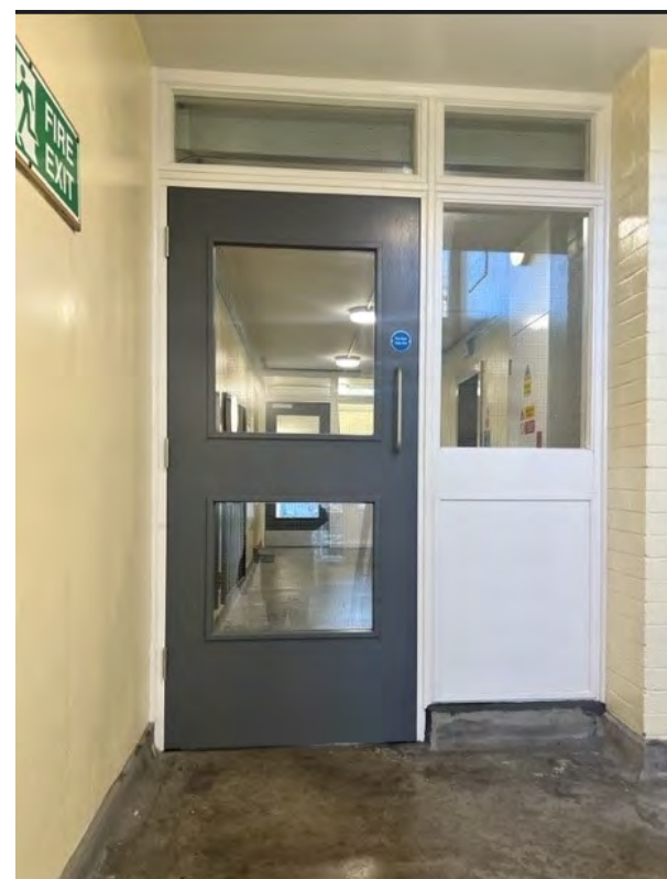
Communal Fire Door at The Combe.