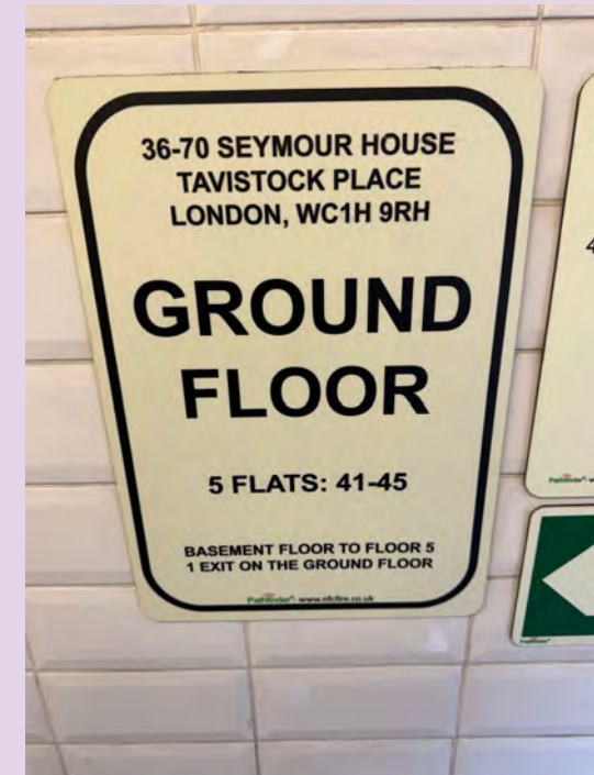
Wayfinding signage at Seymour House

Wayfinding signage is a visual communication tool to assist the Fire and Rescue Service in locating specific flats as they navigate their way round a building.