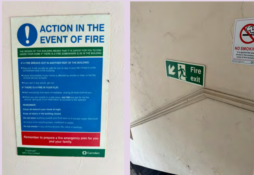
Fire Action Notice and Fire Exit Sign at Seymour House.

We have installed Fire Action Notices and Fire Exit Signs in your building.