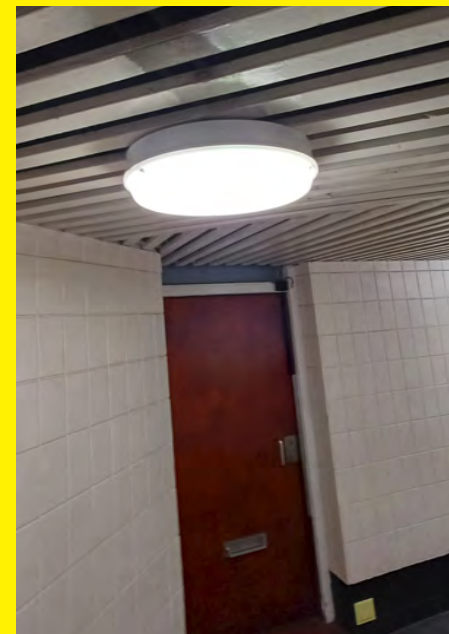
Emergency lighting at Seymour House.

Emergency lighting provides illumination in instances where mains power may have failed. It illuminates escape routes, emergency exit/s and firefighting equipment. It will provide illumination to signage and provide sufficient lighting to help you to escape.