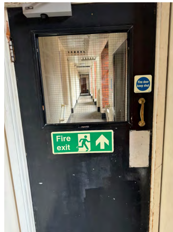
Communal Fire Door at Seymour House.