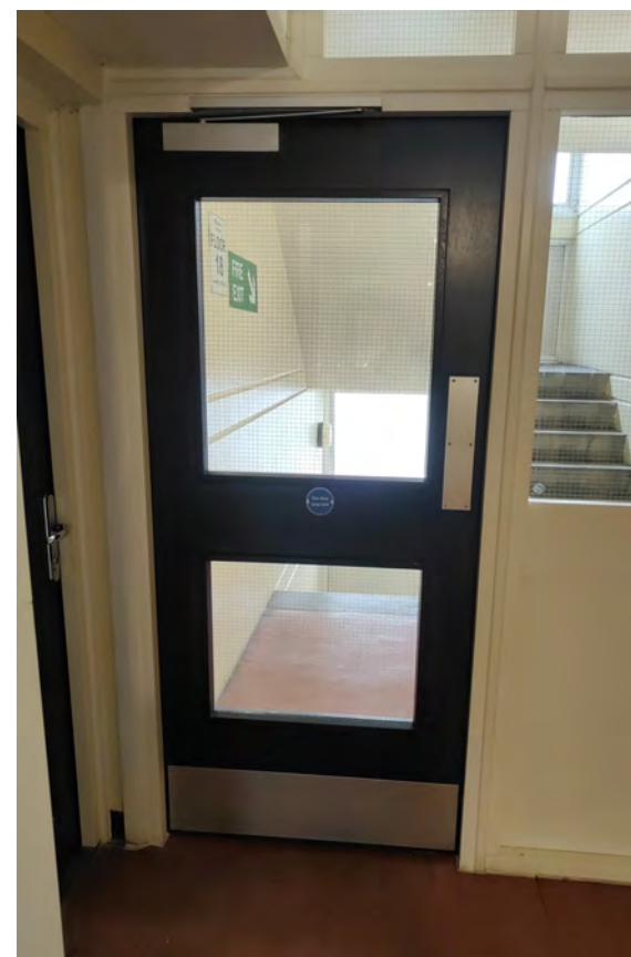
Communal Fire Door at Bucklebury.