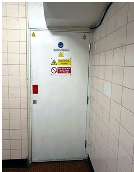
Cupboard Fire Doors at Bucklebury.