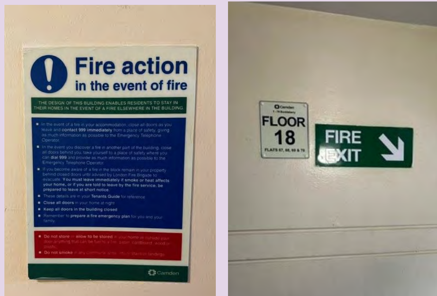
Fire Action Notice and Fire Exit Signage at Bucklebury.

We have installed Fire Action Notices and Fire Exit Signs in your building.