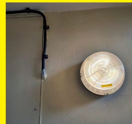
Emergency lighting at Bucklebury.

At Bucklebury, emergency lighting can be found in the fire exit stairwells, along communal landings as you exit the lifts, and in the main entrance lobbies.