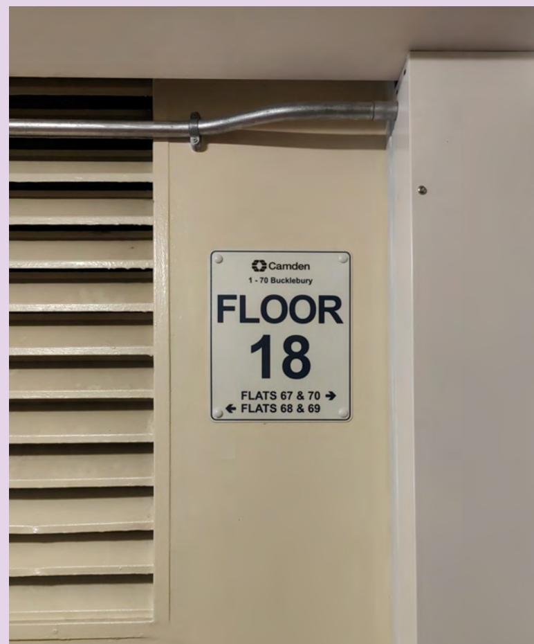
Wayfinding signage at Bucklebury.

Wayfinding signage is a visual communication tool to assist the Fire and Rescue Service in locating specific flats as they navigate their way round a building.