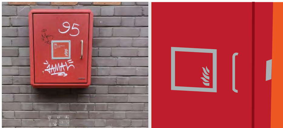
Secure Information Box at Bucklebury.

Secure Information Boxes are easily identifiable storage units for documents intended for use by the fire and rescue service during a fire.