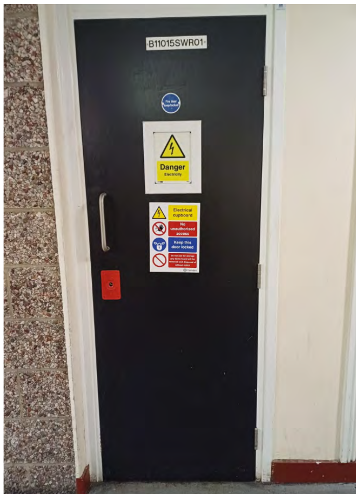
Electrical Cupboard Fire Door at Hardington.

Doors to plant rooms, electrical intake and lift motor rooms (including fire rated hatches or panels)