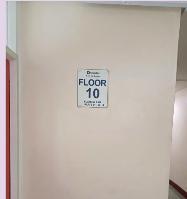
Wayfinding signage at Hardington

Wayfinding signage is a visual communication tool to assist the Fire and Rescue Service in locating specific flats as they navigate their way round a building.