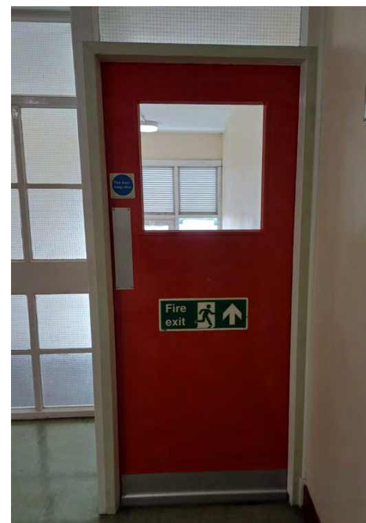
Communal Fire Door at Hardington.