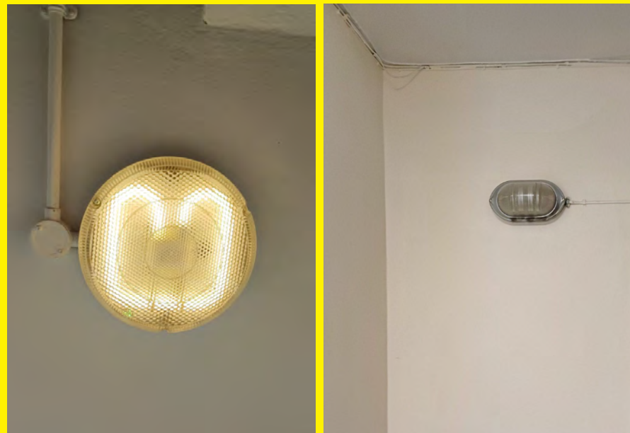
Emergency lighting at Hardington.

Emergency lighting provides illumination in instances where mains power may have failed. It illuminates escape routes, emergency exit/s and firefighting equipment. It will provide illumination to signage and provide sufficient lighting to help you to escape.