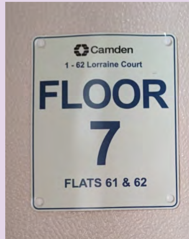
Wayfinding signage at 1-62 Lorraine Court

Wayfinding signage is a visual communication tool to assist the Fire and Rescue Service in locating specific flats as they navigate their way round a building.