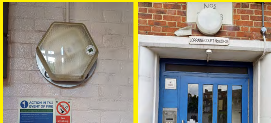
Emergency lighting at 1-62 Lorraine Court.

Emergency lighting provides illumination in instances where mains power may have failed. It illuminates escape routes, emergency exit/s and firefighting equipment. It will provide illumination to signage and provide sufficient lighting to help you to escape.