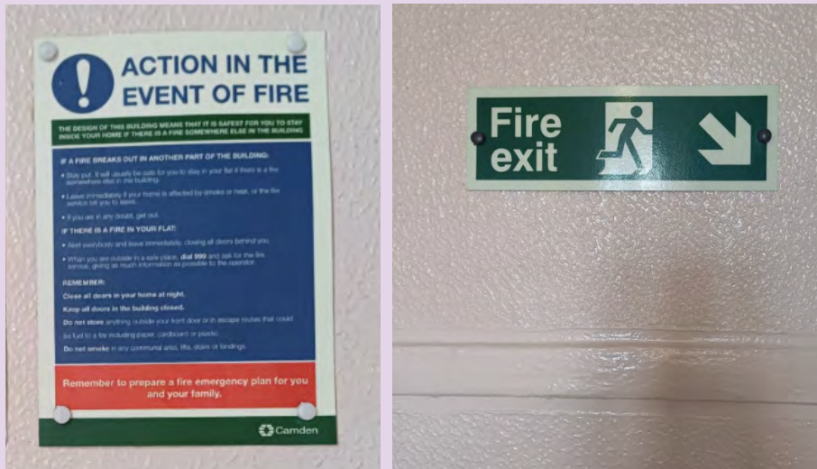
Fire Action Notice at and Fire Exit Sign at 1-62 Lorraine Court.

We have installed Fire Action Notices and Fire Exit Signs in your building.