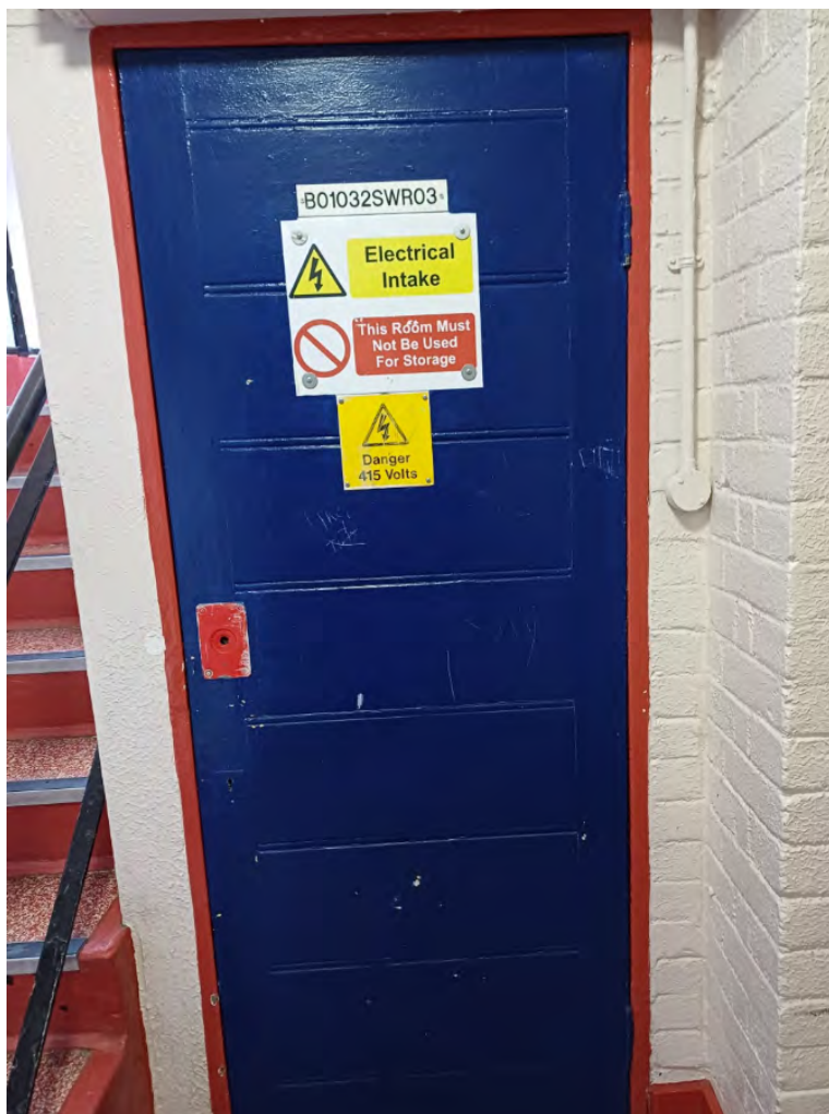
Electrical Intake Fire Door at 1-62 Lorraine Court.

Doors to plant rooms, electrical intake and lift motor rooms (including fire rated hatches or panels)