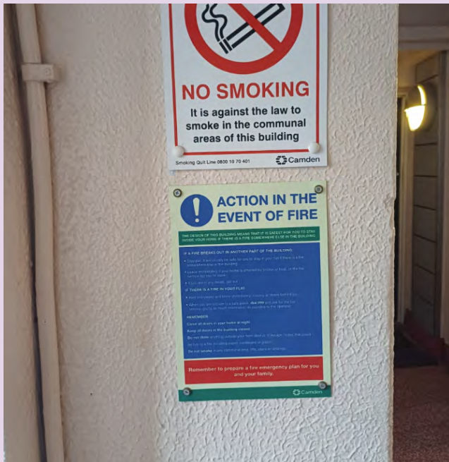
Fire Action Notice at Candida Court.

We have installed Fire Action Notices in your building.