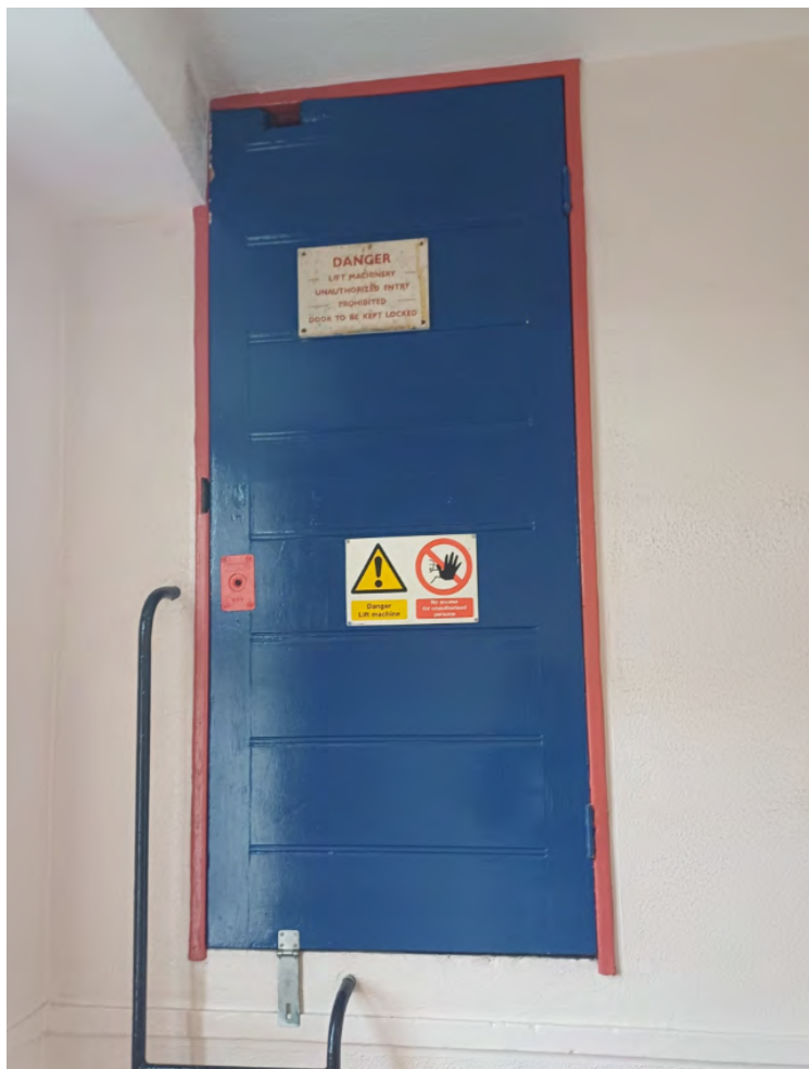
Lift Room Fire Door at Candida Court.

Doors to plant rooms, electrical intake and lift motor rooms (including fire rated hatches or panels)