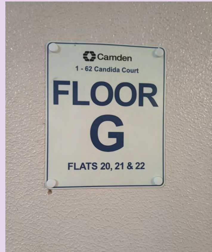
Wayfinding signage at Candida Court

Wayfinding signage is a visual communication tool to assist the Fire and Rescue Service in locating specific flats as they navigate their way round a building.