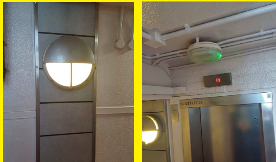
Emergency lighting at Candida Court.

Emergency lighting provides illumination in instances where mains power may have failed. It illuminates escape routes, emergency exit/s and firefighting equipment. It will provide illumination to signage and provide sufficient lighting to help you to escape.