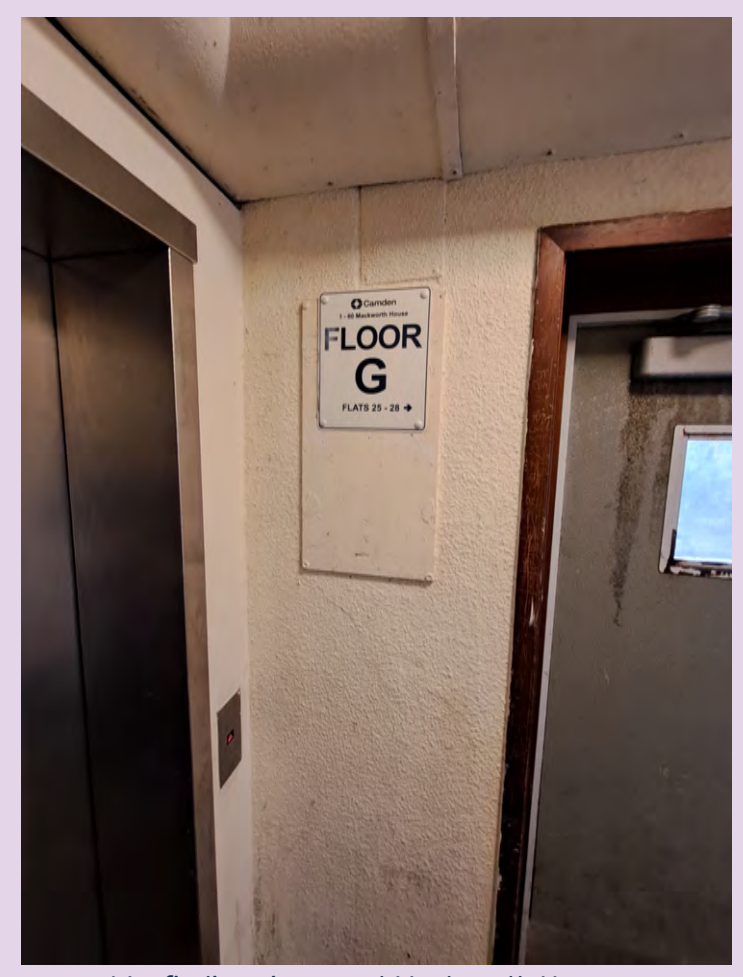
Wayfinding signage at Mackworth House.

Wayfinding signage is a visual communication tool to assist the Fire and Rescue Service in locating specific flats as they navigate their way round a building