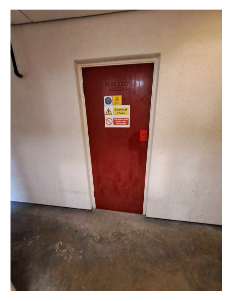
Electrical intake cupboard at Mackworth House.