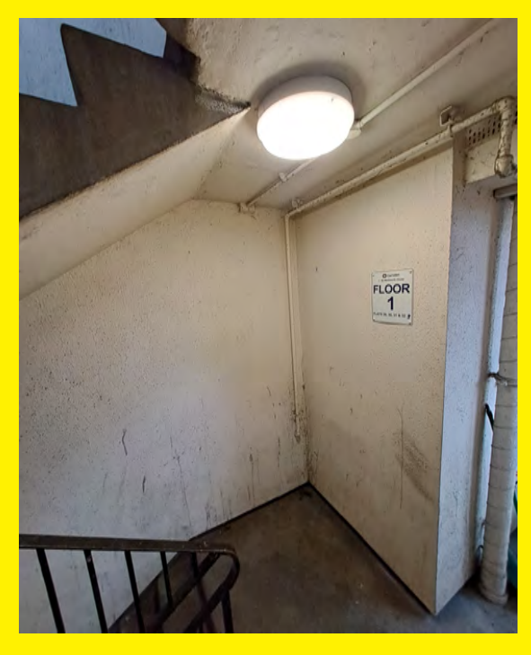
Emergency lighting in the stairwell at Mackworth House.

Emergency lighting provides illumination in instances where mains power may have failed. It illuminates escape routes, emergency exit/s and firefighting equipment. It will provide illumination to signage and provide sufficient lighting to help you to escape.