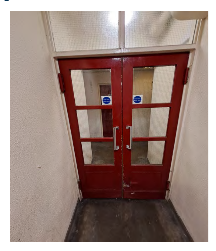
Communal Fire Door leading to the stairwell at Mackworth House.