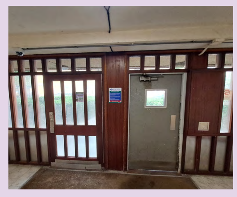
Fire Action Notice on the ground floor at main entrance at Mackworth House.

We have installed Fire Action Notices and Fire Exit Signs in your building.