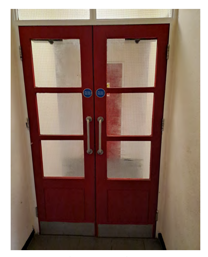
Communal Fire Door at Harrington House.