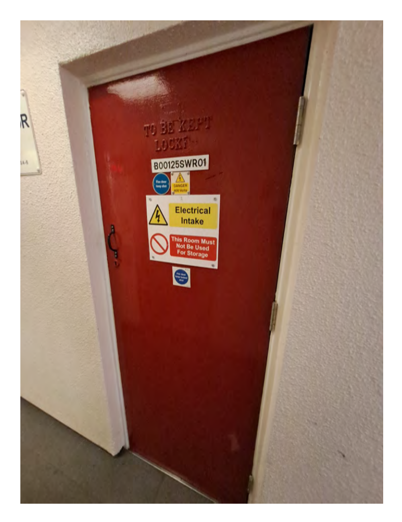
Electrical intake cupboard at Harrington House.