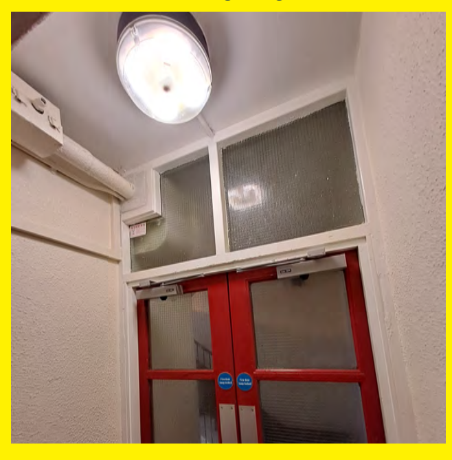
Emergency lighting in the communal area at Harrington House.

Emergency lighting provides illumination in instances where mains power may have failed. It illuminates escape routes, emergency exit/s and firefighting equipment. It will provide illumination to signage and provide sufficient lighting to help you to escape.