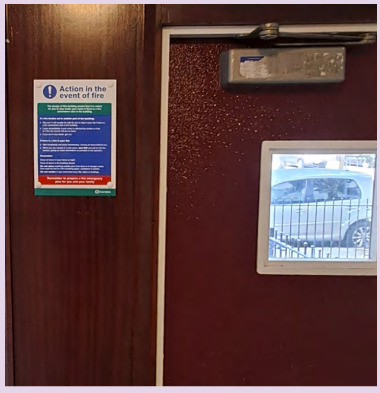
Fire Action Notice at Harrington House.

We have installed Fire Action Notices and Fire Exit Signs in your building.