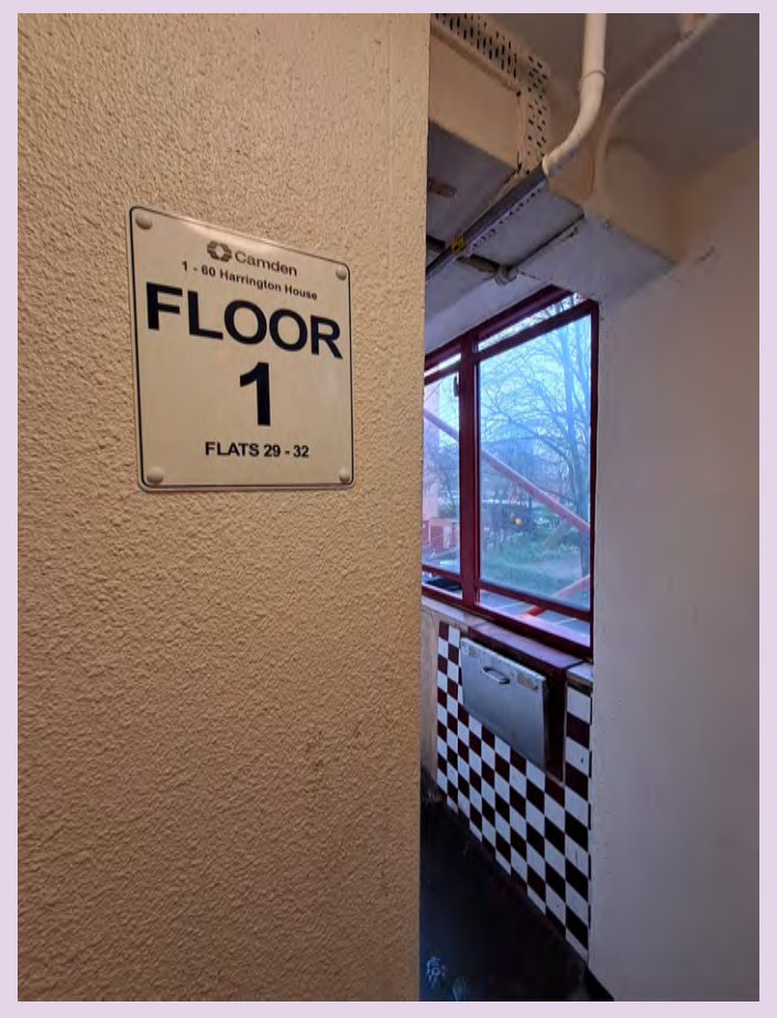
First floor wayfinding signage at Harrington House.

Wayfinding signage is a visual communication tool to assist the Fire and Rescue Service in locating specific flats as they navigate their way round a building.