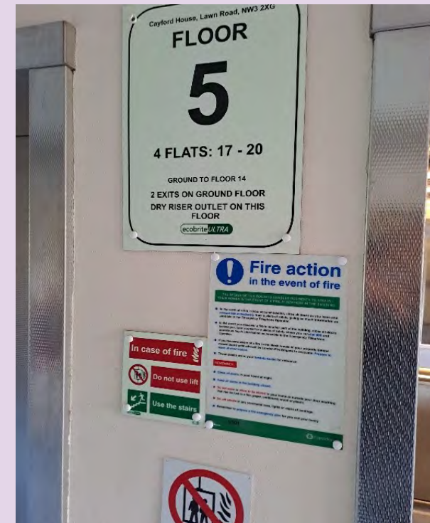
Wayfinding signage by lift on the fifth floor at Cayford House.

Wayfinding signage is a visual communication tool to assist the Fire and Rescue Service in locating specific flats as they navigate their way round a building.