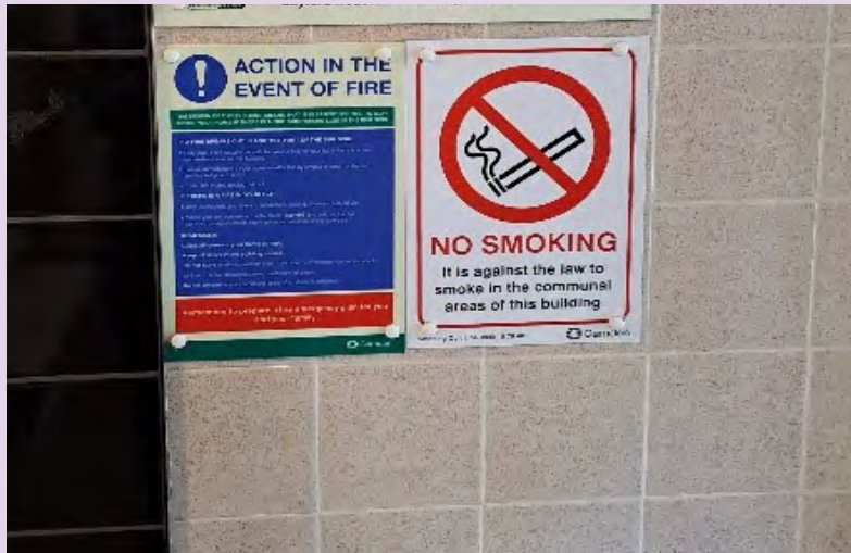
Fire Action Notice at Cayford House.

We have installed Fire Action Notices and Fire Exit Signs in your building.