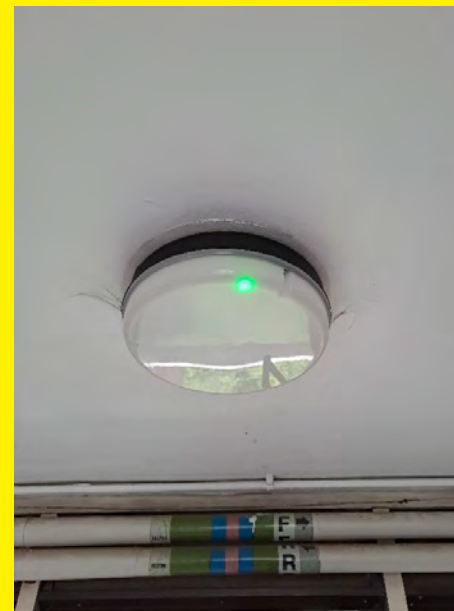
Emergency lighting at Cayford House.

Emergency lighting provides illumination in instances where mains power may have failed. It illuminates escape routes, emergency exit/s and firefighting equipment. It will provide illumination to signage and provide sufficient lighting to help you to escape.