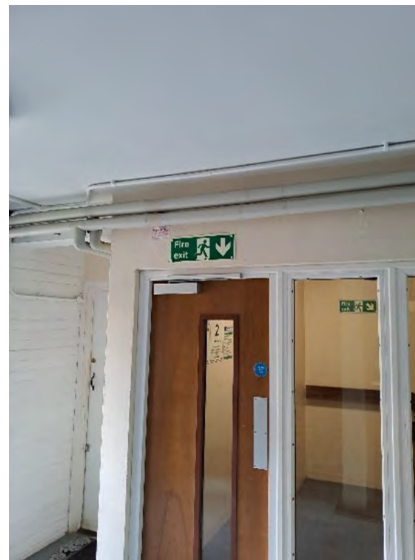
Communal area fire door at Cayford House.