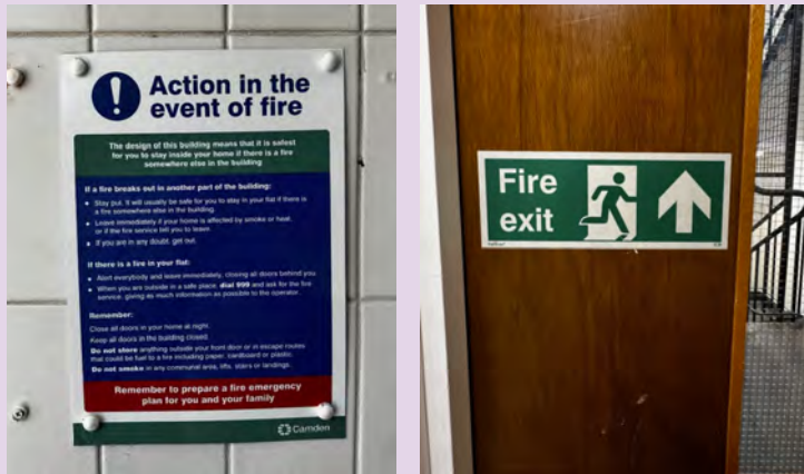
Fire Action Notice and Fire Exit Sign at 1-56 Babington Court.

We have installed Fire Action Notices and Fire Exit Signs in your building.