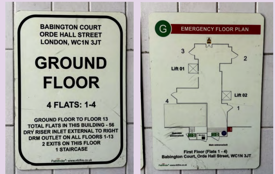
Wayfinding signage at 1-56 Babington Court

Wayfinding signage is a visual communication tool to assist the Fire and Rescue Service in locating specific flats as they navigate their way round a building.