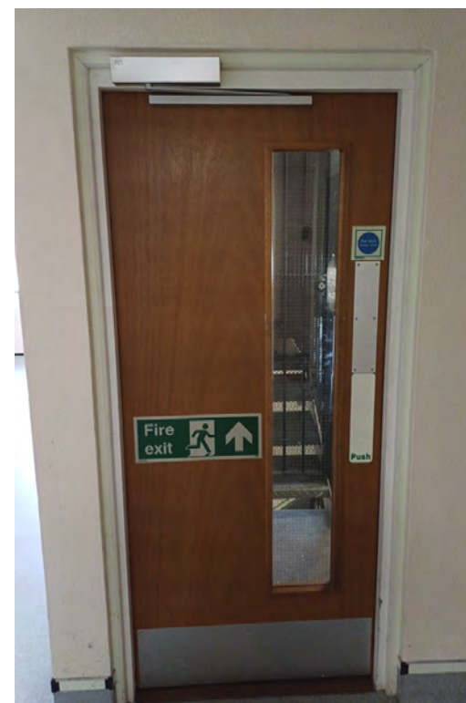
Communal fire door at 1-56 Babington Court.