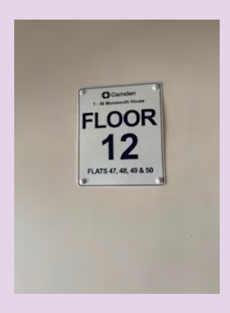
Wayfinding signage at Monmouth House.

Wayfinding signage is a visual communication tool to assist the Fire and Rescue Service in locating specific flats as they navigate their way round a building.