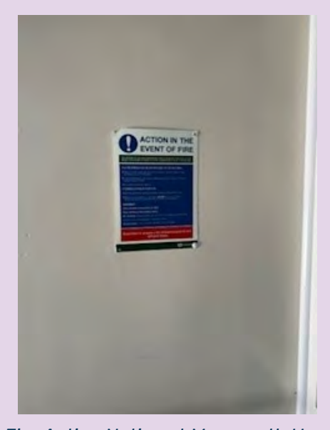
Fire Action Notice at Monmouth House.

We have installed Fire Action Notices and Fire Exit Signs in your building.