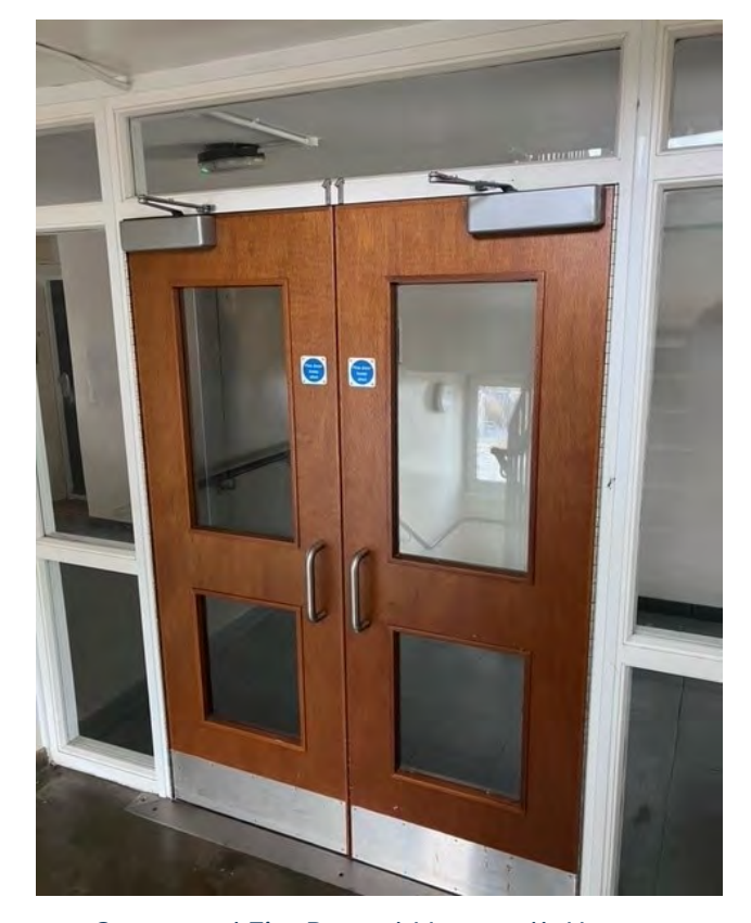
Communal Fire Door at Monmouth House.