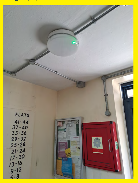
Emergency lighting and Secure Information Box at Swallowfield.

The lighting should illuminate all escape routes, emergency exit/s and firefighting equipment.