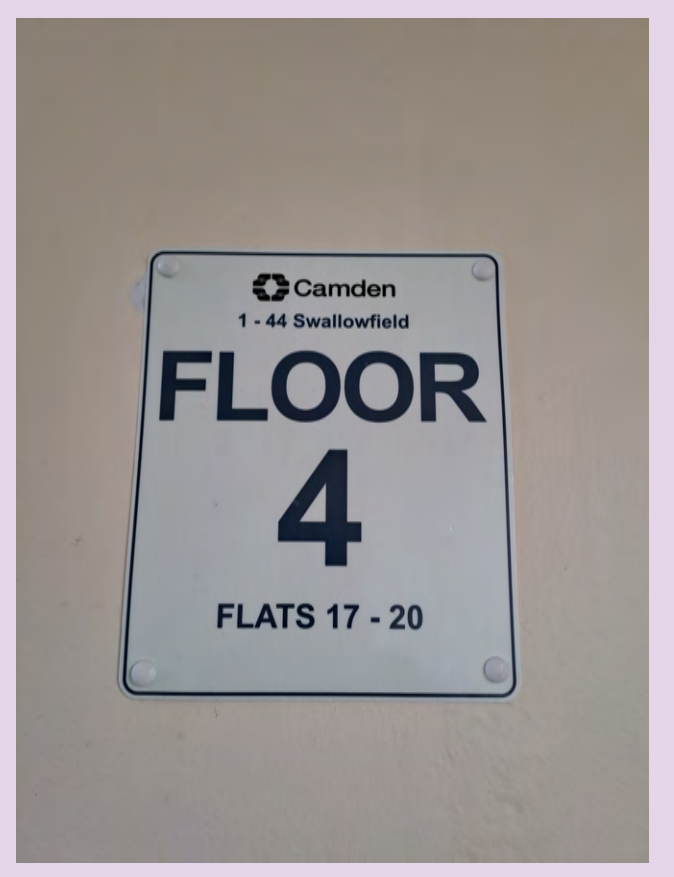
Wayfinding signage at Swallowfield.

Wayfinding signage is a visual communication tool to assist the Fire and Rescue Service in locating specific flats as they navigate their way round a building.