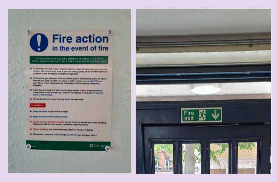
Fire Action Notice and Fire Exit Sign at Swallowfield.

We have installed Fire Action Notices and Fire Exit Signs in your building.