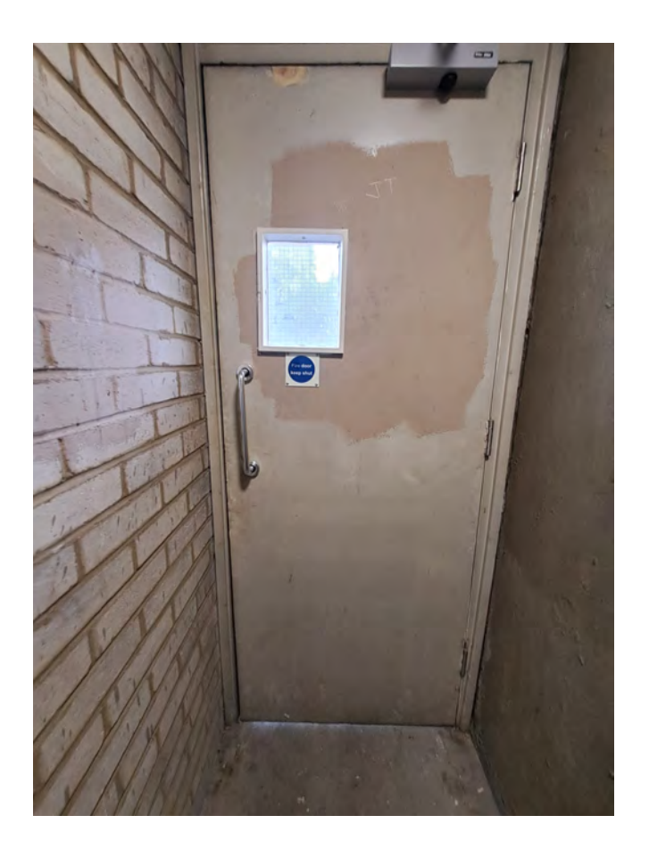
Communal Fire Door at Swallowfield.