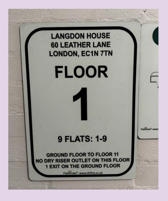
Wayfinding signage at 1-44 Langdon House.

Wayfinding signage is a visual communication tool to assist the Fire and Rescue Service in locating specific flats as they navigate their way round a building.