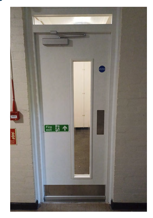
Communal Fire Door at 1-44 Langdon House.