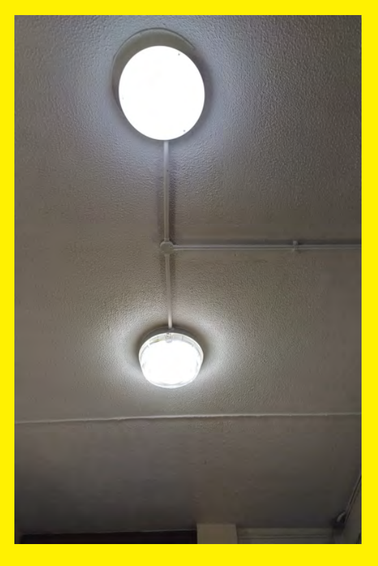
Emergency lighting at 1-44 Langdon House.

Emergency lighting provides illumination in instances where mains power may have failed. It illuminates escape routes, emergency exit/s and firefighting equipment. It will provide illumination to signage and provide sufficient lighting to help you to escape.