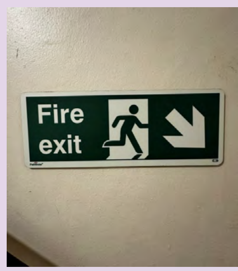
Fire Action Notice and Fire Exit Sign at 1-44 Langdon House.