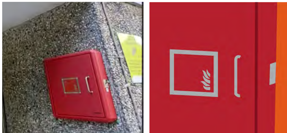
Secure Information Box at 1-44 Grasmere Osnaburgh Street

Secure Information Boxes are easily identifiable storage units for documents intended for use by the fire and rescue service during a fire.