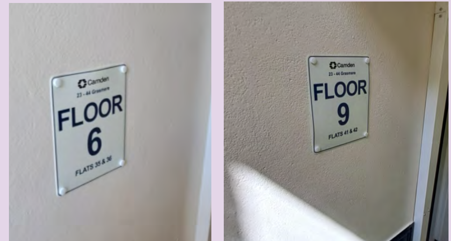
Wayfinding signage at 1-44 Grasmere Osnaburgh Street.

Wayfinding signage is a visual communication tool to assist the Fire and Rescue Service in locating specific flats as they navigate their way round a building.