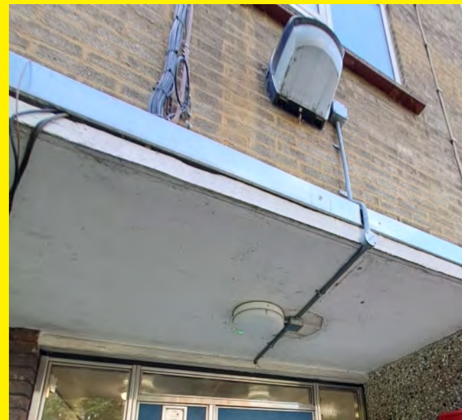
Emergency lighting at 1-44 Grasmere Osnaburgh Street.

Emergency lighting provides illumination in instances where mains power may have failed. It illuminates escape routes, emergency exit/s and firefighting equipment. It will provide illumination to signage and provide sufficient lighting to help you to escape.