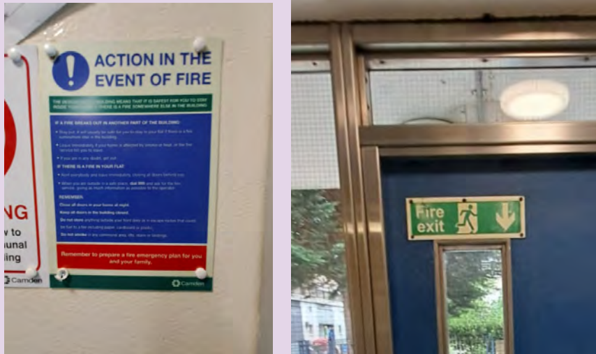
Fire Action Notice and Fire Exit Sign at 1-44 Grasmere Osnaburgh Street.

We have installed Fire Action Notices and Fire Exit Signs in your building.