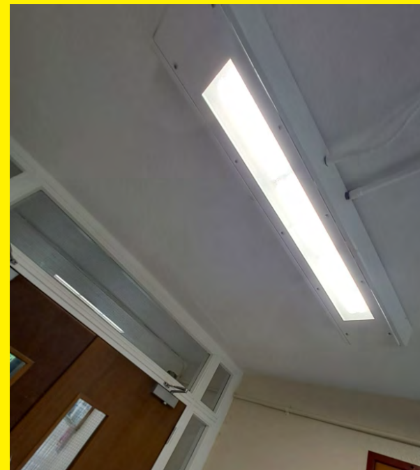
Emergency lighting at 1-44 Derwent Robert Street

Emergency lighting provides illumination in instances where mains power may have failed. It illuminates escape routes, emergency exit/s and firefighting equipment. It will provide illumination to signage and provide sufficient lighting to help you to escape.