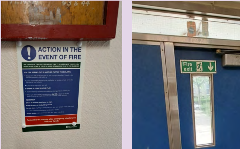
Fire Action Notice and Fire Exit Sign at 1-44 Derwent Robert Street .

We have installed Fire Action Notices and Fire Exit Signs in your building.