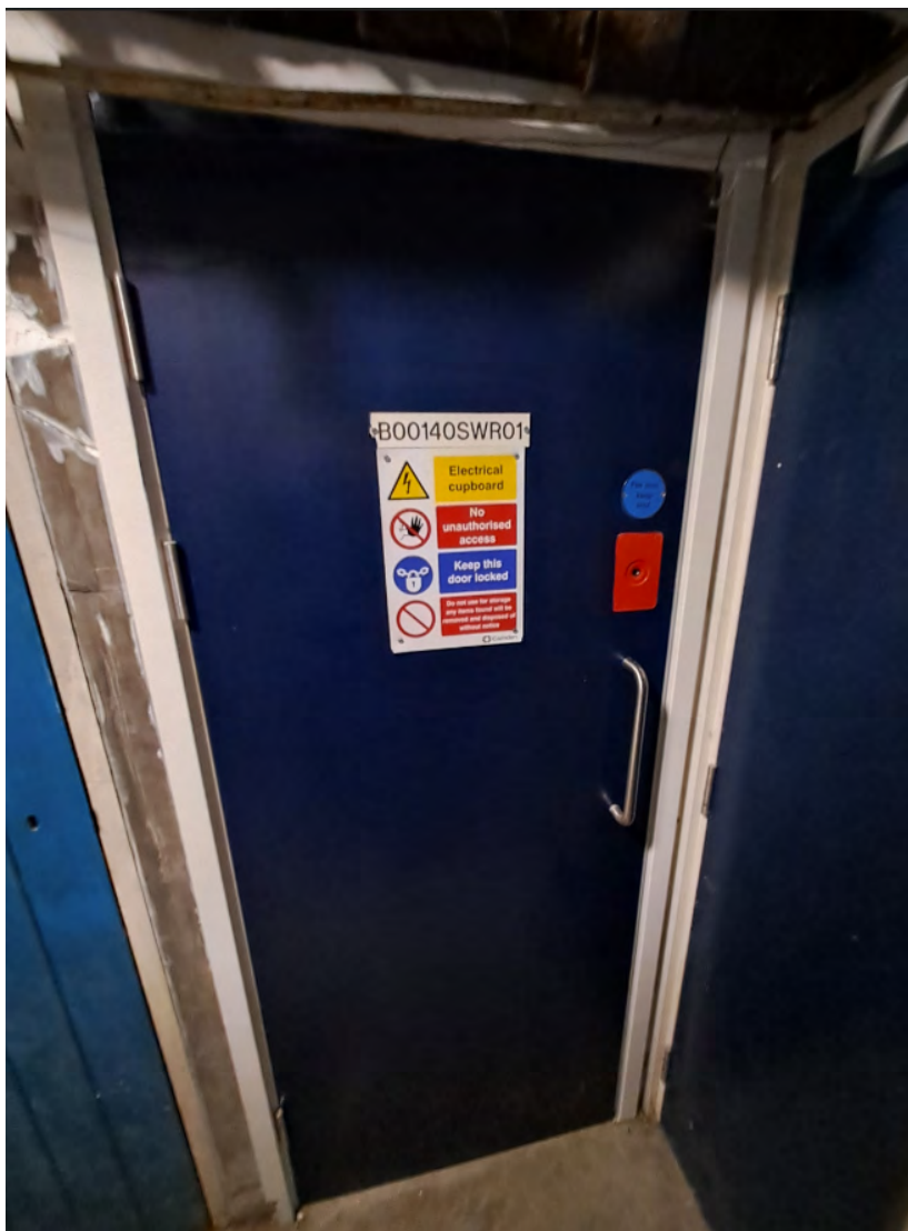
Electrical intake cupboard fire door at 1-44 Derwent Robert Street .

Doors to plant rooms, electrical intake and lift motor rooms (including fire rated hatches or panels)