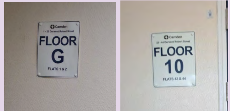
Wayfinding signage at 1-44 Derwent Robert Street

Wayfinding signage is a visual communication tool to assist the Fire and Rescue Service in locating specific flats as they navigate their way round a building.