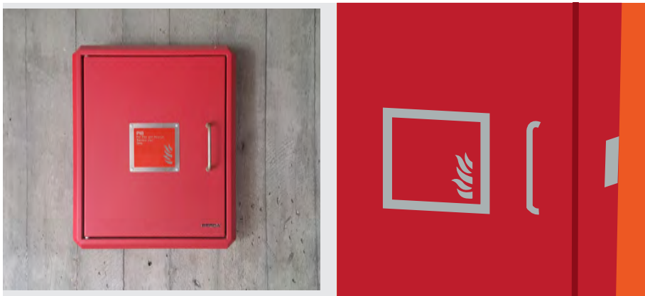
Secure Information Box at Grangemill.

Secure Information Boxes are easily identifiable storage units for documents intended for use by the fire and rescue service during a fire.