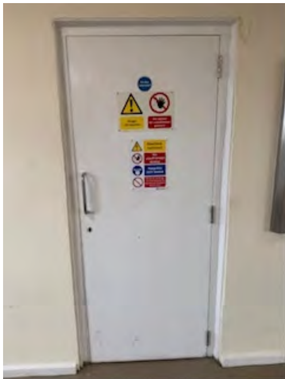
Plant Room Fire Door at 1-43 Grange Mill.

Doors to plant rooms, electrical intake and lift motor rooms (including fire rated hatches or panels)