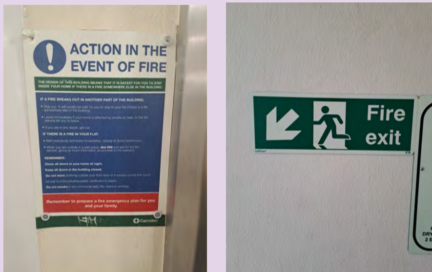
Fire Action Notice and Fire Exit Signs at 1-43 Grange Mill.

We have installed Fire Action Notices and Fire Exit Signs in your building.