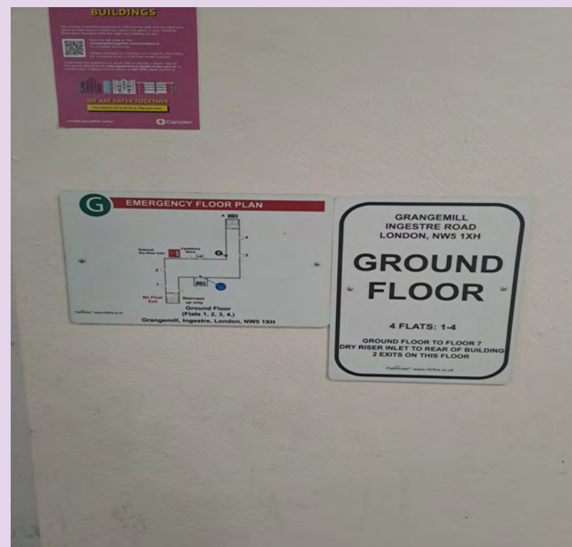
Emergency floor plan and level wayfinding signage in communal area at 1-43 Grange Mill.

Wayfinding signage is a visual communication tool to assist the Fire and Rescue Service in locating specific flats as they navigate their way round a building.