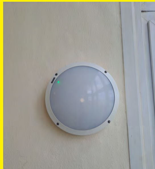
Emergency lighting at Grangemill.

The lighting should illuminate all escape routes, emergency exit/s and firefighting equipment.