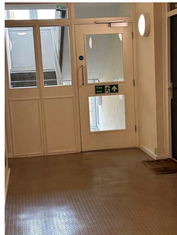
Communal Fire Door at 1-43 Grange Mill.