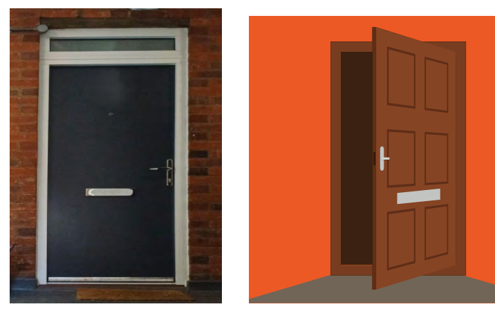
Front Entrance Door at Windmill.

In your building, the doors to the the two entrances and exits in the building are fire doors. Your front door may be a fire door.