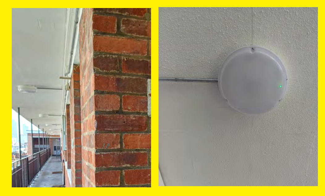
Emergency lighting at Windmill.

The lighting should illuminate all escape routes, emergency exit/s and firefighting equipment.