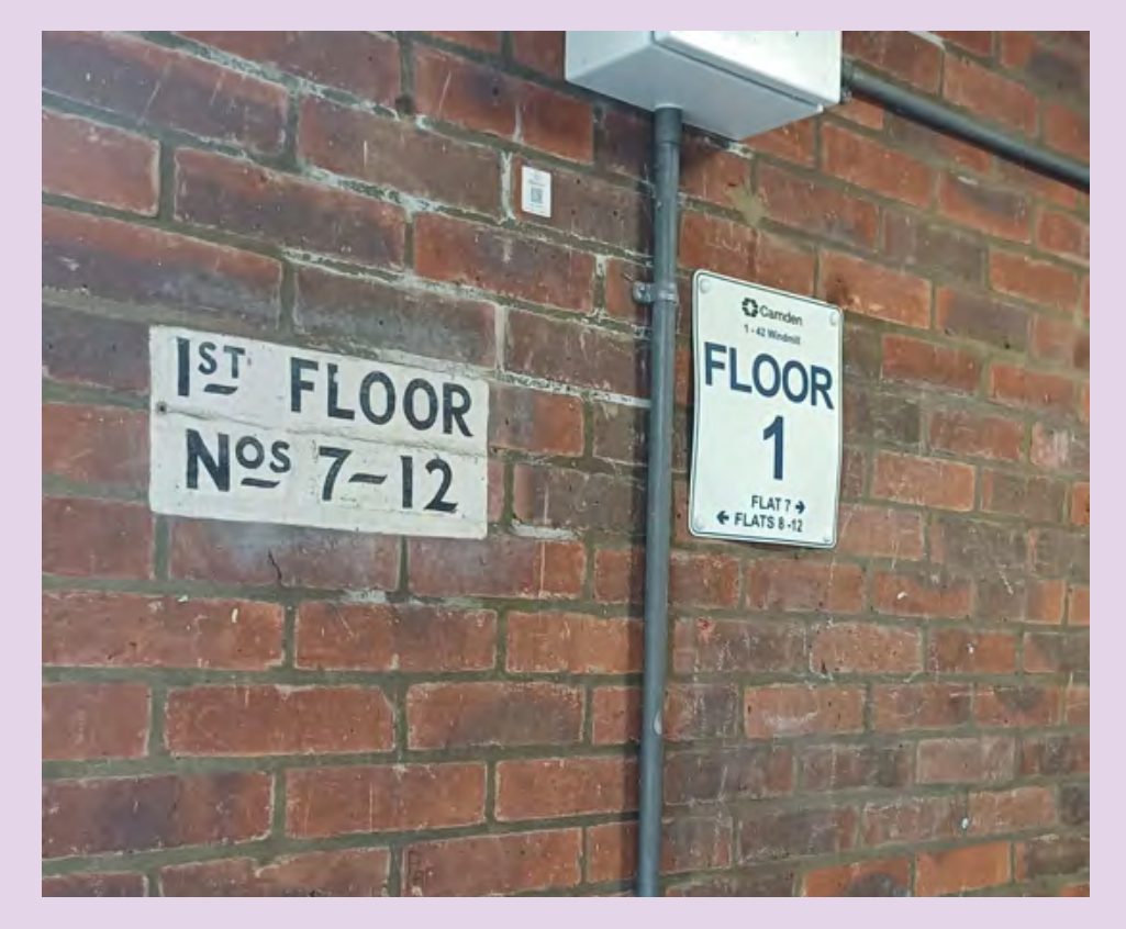
Wayfinding signage at Windmill.

Wayfinding signage is a visual communication tool to assist the Fire and Rescue Service in locating specific flats as they navigate their way round a building.