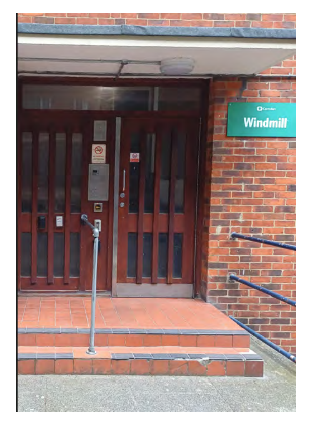
Communal Fire Door at Windmill.