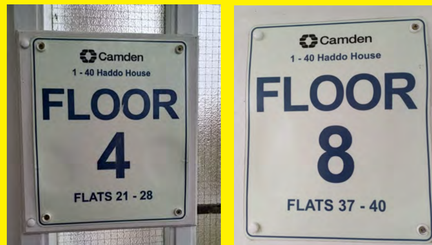
Wayfinding Signage at Haddo House.

Wayfinding signage is a visual communication tool to assist the Fire and Rescue Service in locating specific flats as they navigate their way round a building