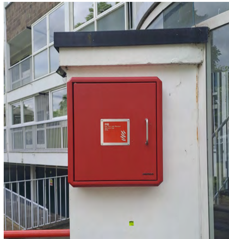
Secure Information Box at Haddo House.

If you need help to evacuate your flat number and floor number information will be stored in the secure premises information box, which the London Fire Brigade will access in an emergency, so they know you need help and are able to support you. We may contact you about an emergency plan or request your consent to refer you to the most appropriate council service.