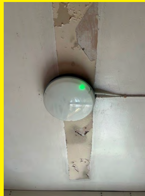
Emergency lighting at Bridge House.

The lighting should illuminate all escape routes, emergency exit/s and firefighting equipment.