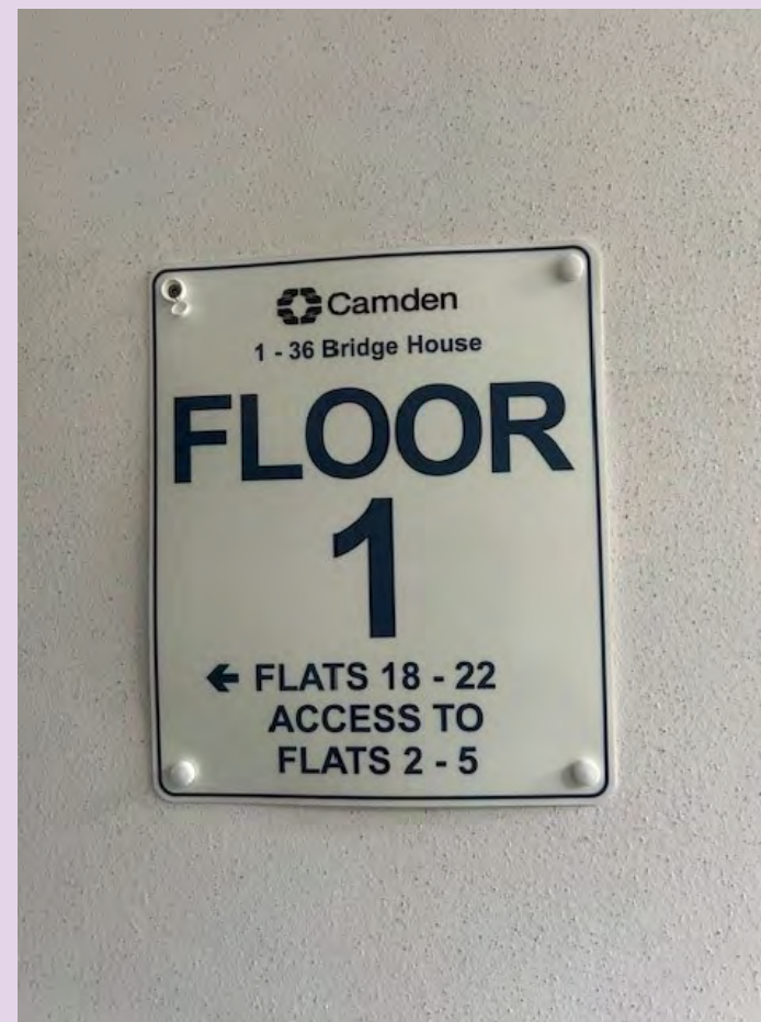
First floor wayfinding signage at Bridge House.

Wayfinding signage is a visual communication tool to assist the Fire and Rescue Service in locating specific flats as they navigate their way round a building.