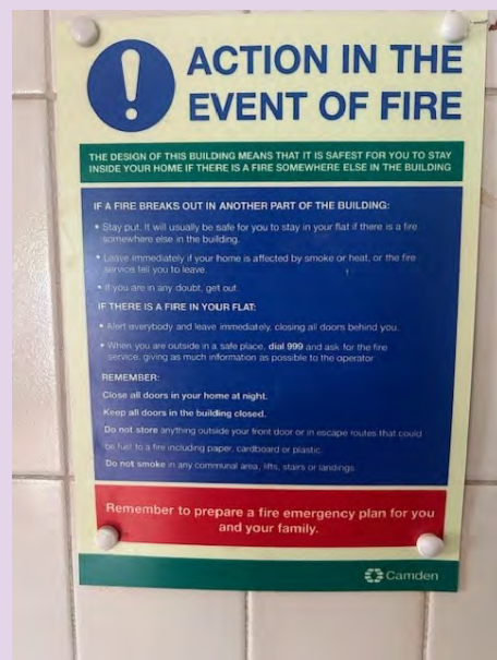
Fire Action Notice at Bridge House.

We have installed Fire Action Notices and Fire Exit Signs in your building.