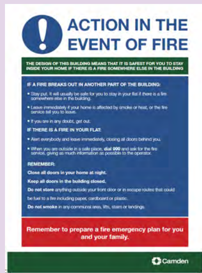
Fire Action Notice

We have installed Fire Action Notices and Fire Exit Signs in your building.