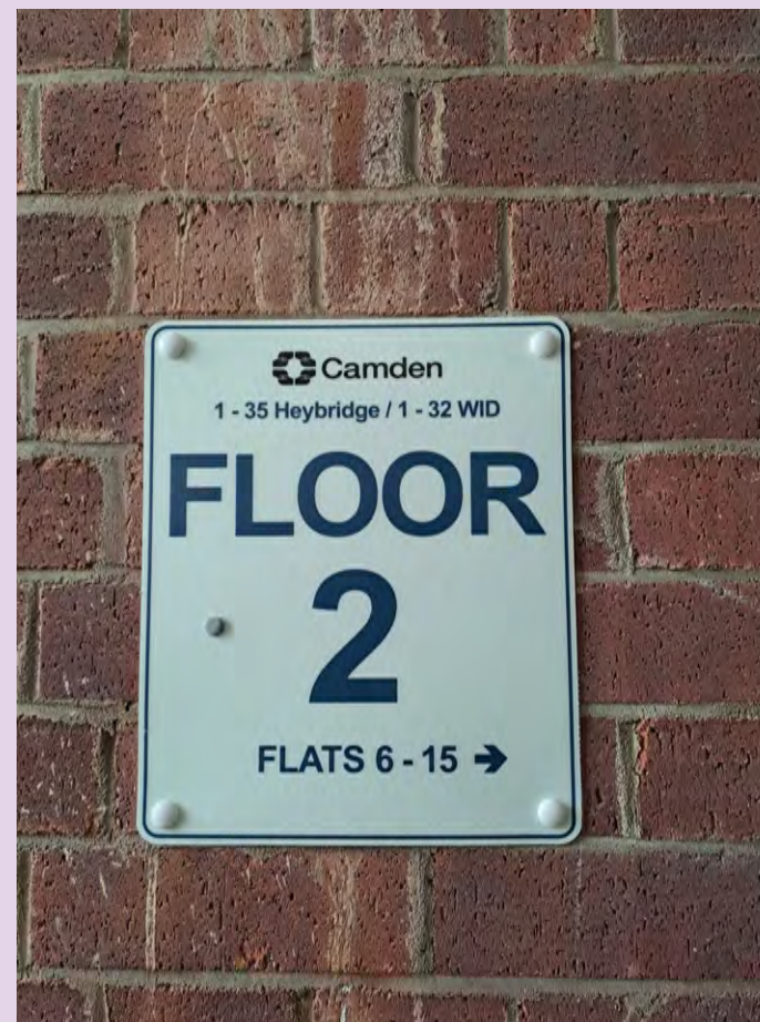
Wayfinding signage at 1-35 Heybridge.

Wayfinding signage is a visual communication tool to assist the Fire and Rescue Service in locating specific flats as they navigate their way round a building.