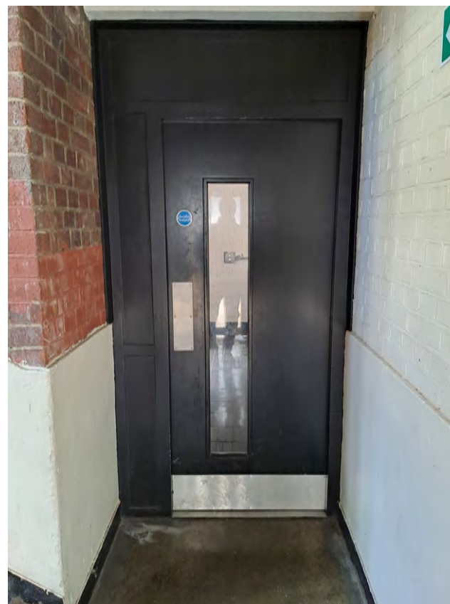
Communal area fire door at 1-35 Heybridge.