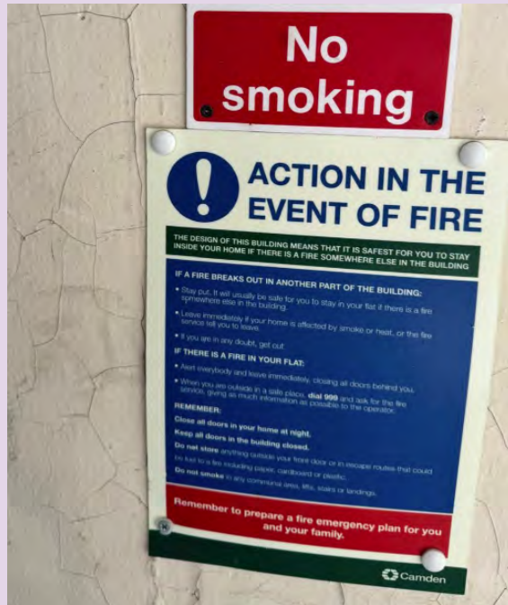
Fire Action Notice at 1-32 Sandfield.

We have installed fire action notices and fire exit signs in your building.