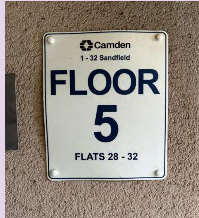
Wayfinding signage at 1-32 Sandfield.

Wayfinding signage is a visual communication tool to assist the Fire and Rescue Service in locating specific flats as they navigate their way round a building.