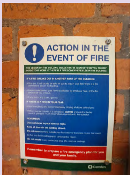
Fire Action Notice at Rugmere.

We have installed Fire Action Notices and Fire Exit Signs in your building.