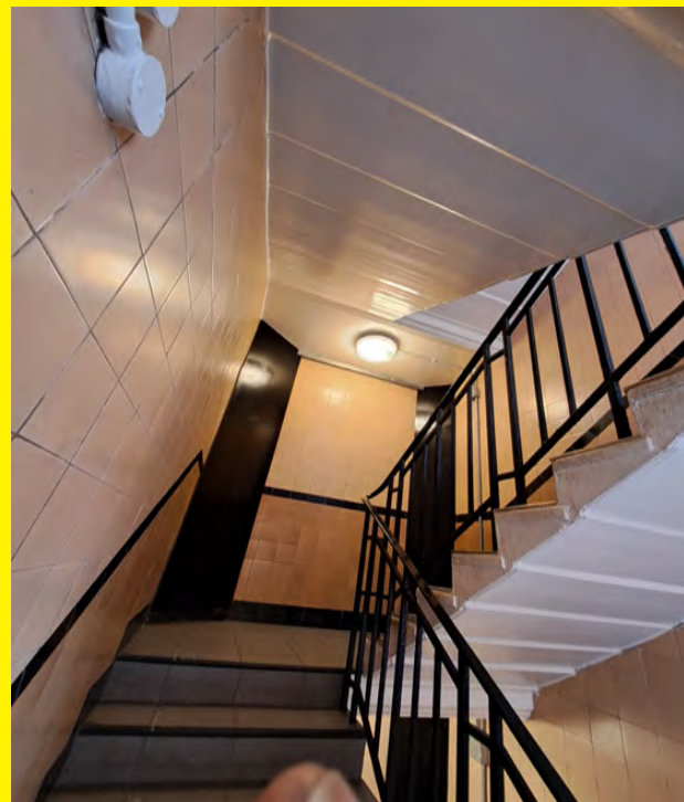
Emergency lighting at Rugmere.

The lighting should illuminate all escape routes, emergency exit/s and firefighting equipment.