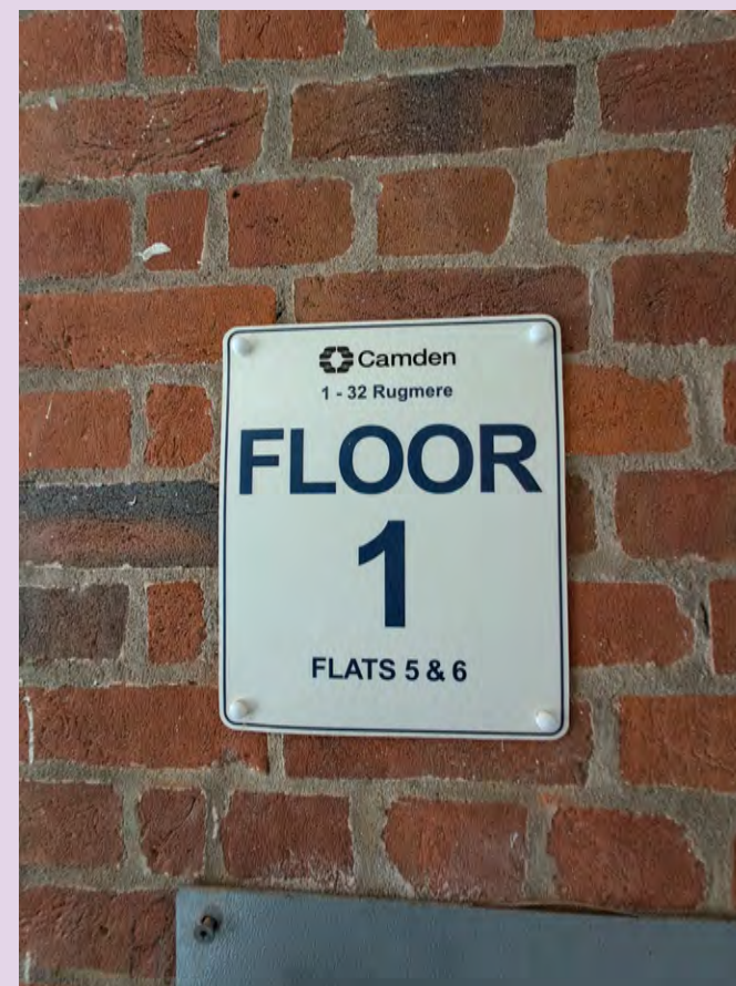
First floor wayfinding signage at Rugmere.

Wayfinding signage is a visual communication tool to assist the Fire and Rescue Service in locating specific flats as they navigate their way round a building.