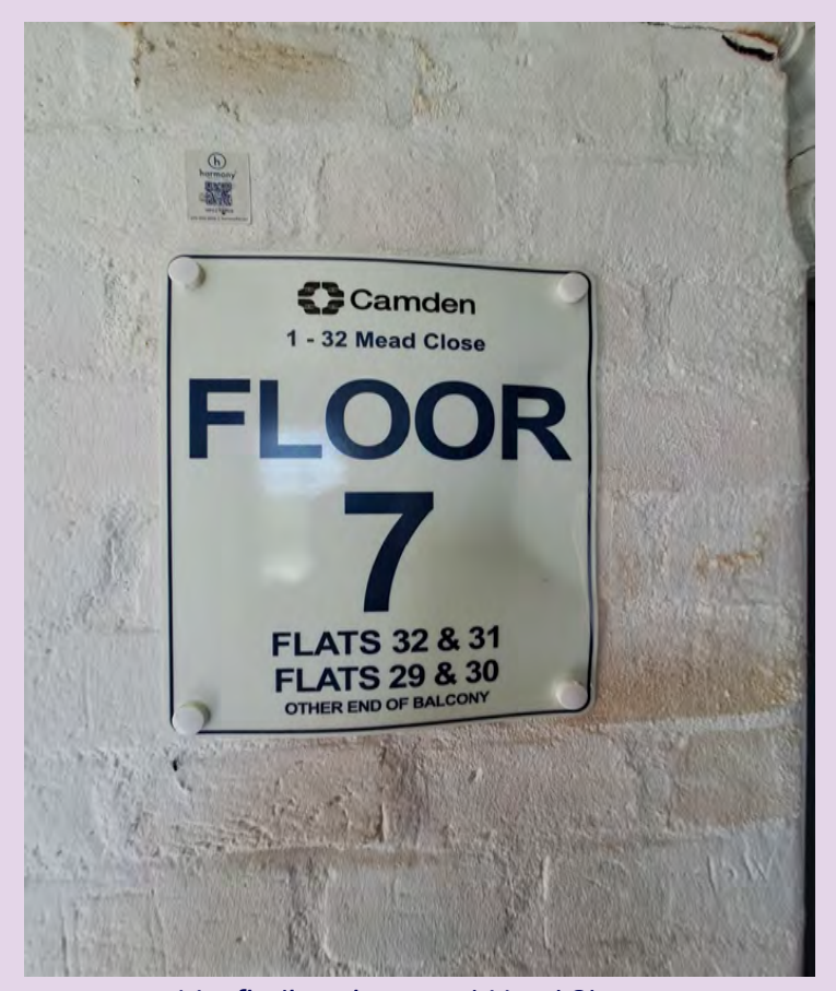
Wayfinding signage at Mead Close.

Wayfinding signage is a visual communication tool to assist the Fire and Rescue Service in locating specific flats as they navigate their way round a building.