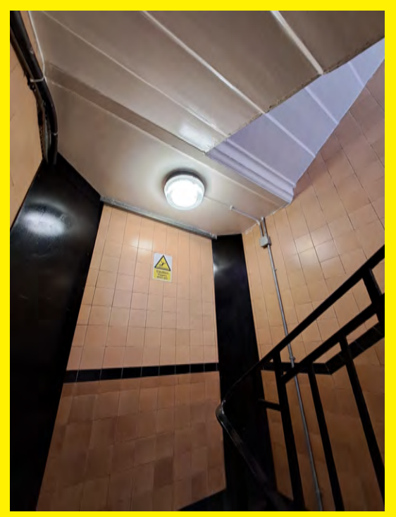
Emergency lighting at Mead Close.

The lighting should illuminate all escape routes, emergency exit/s and firefighting equipment.