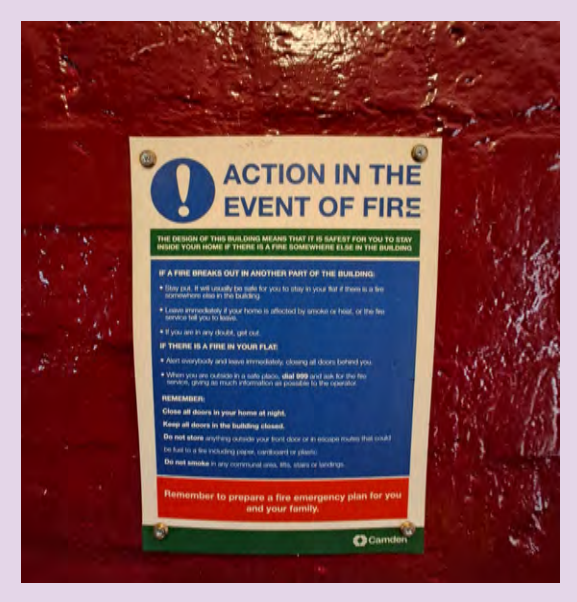
Fire Action Notice at Mead Close.

We have installed Fire Action Notices and Fire Exit Signs in your building.