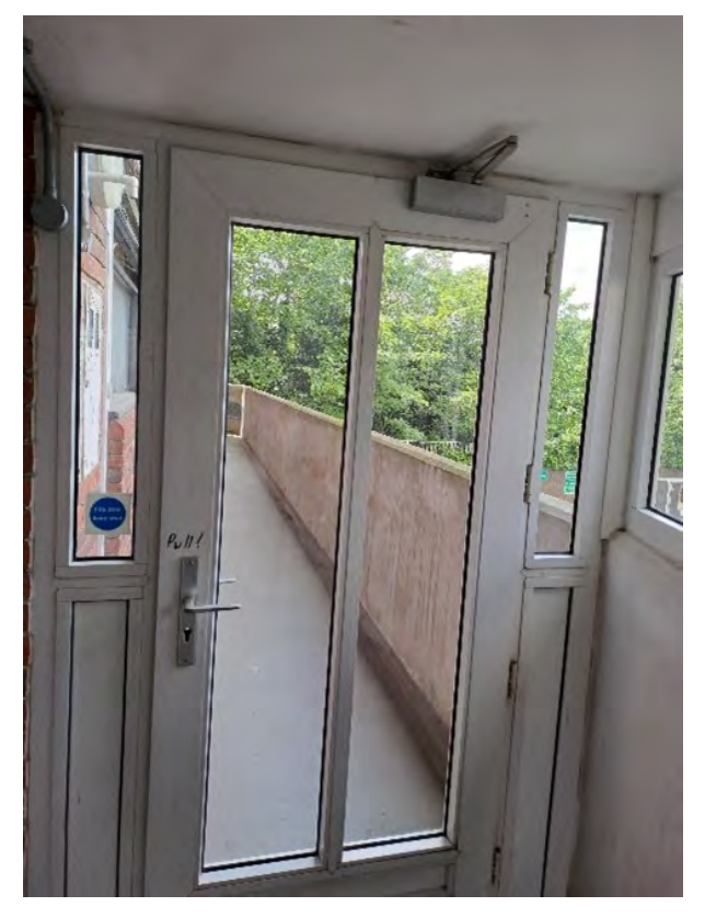
Fire door leading to stairwell lobby at Ellerton House.