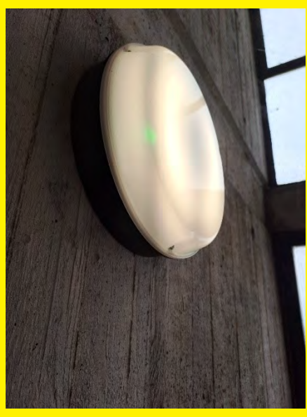
Emergency lighting at Ellerton House.

Emergency lighting provides illumination in instances where mains power may have failed. It illuminates escape routes, emergency exit/s and firefighting equipment. It will provide illumination to signage and provide sufficient lighting to help you to escape.