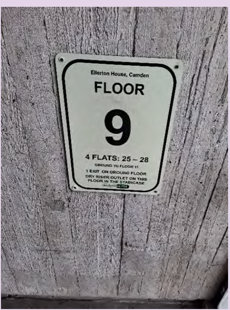
Wayfinding signage in various locations at Ellerton House.

Wayfinding signage at Ellerton House can be found in the main lift lobby on the ground floor and every floor lobby. These signs are located on the stairwell walls and on doors leading to the means of escape.