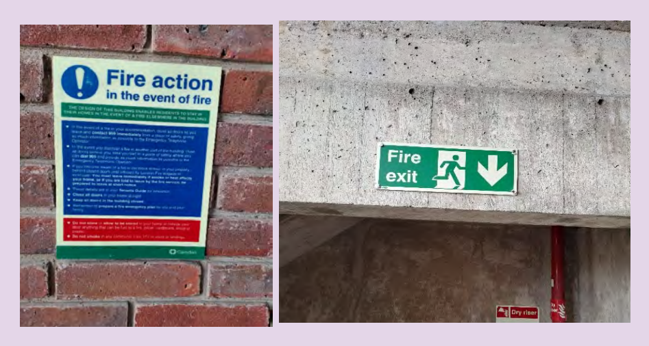
Fire Action Notice and Fire Exit Sign at Ellerton House

We have installed Fire Action Notices and Fire Exit Signs in your building.