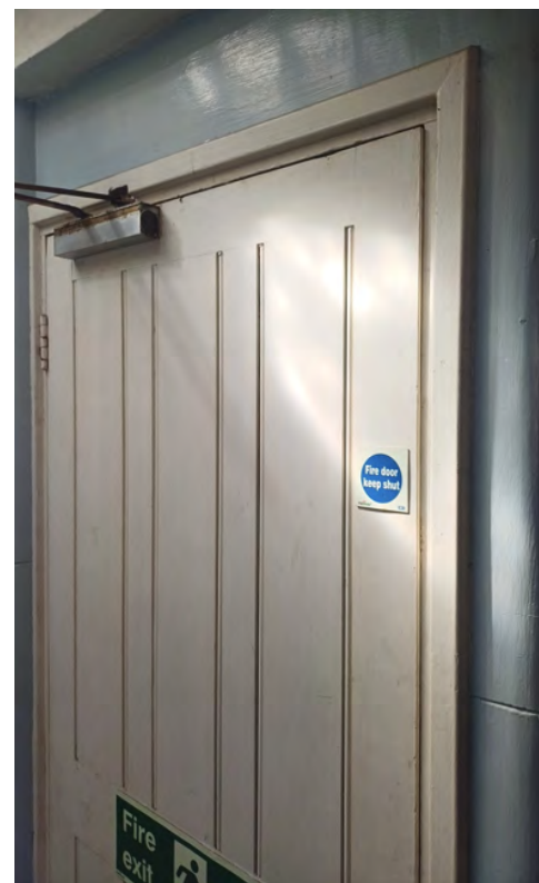
Communal Fire Door at 1-30 Winston.