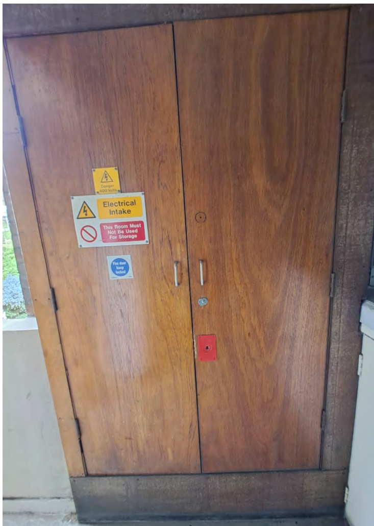
Electrical Intake Cupboard Fire Door at 1-30 Winston.

Doors to plant rooms, electrical intake and lift motor rooms (including fire rated hatches or panels)