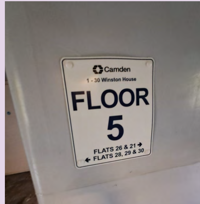
Wayfinding signage at 1-30 Winston

Wayfinding signage is a visual communication tool to assist the Fire and Rescue Service in locating specific flats as they navigate their way round a building.