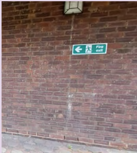
Fire Action Notice and Fire Exit Sign at 1-30 Winston.