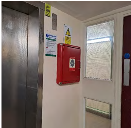
Secure Information Box at Bray Tower.

If you need help in the event of an emergency such as a fire, due to a physical disability or long term medical condition or another disorder, please let us know.