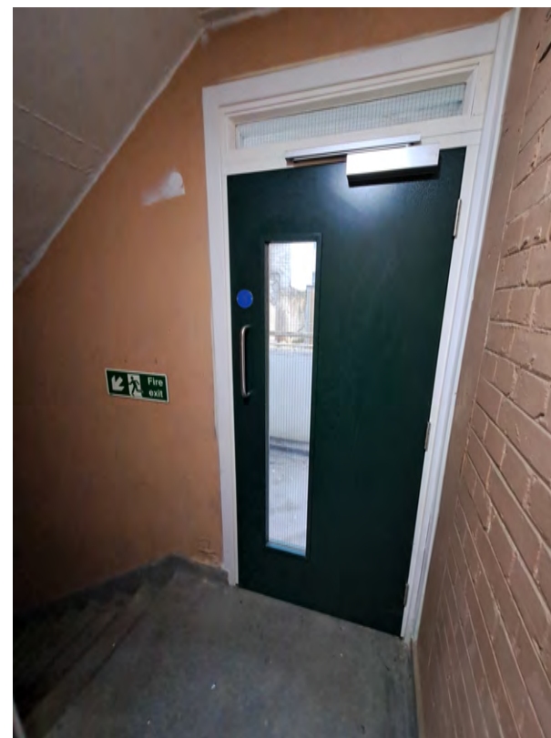
Communal Fire door at Faversham House.