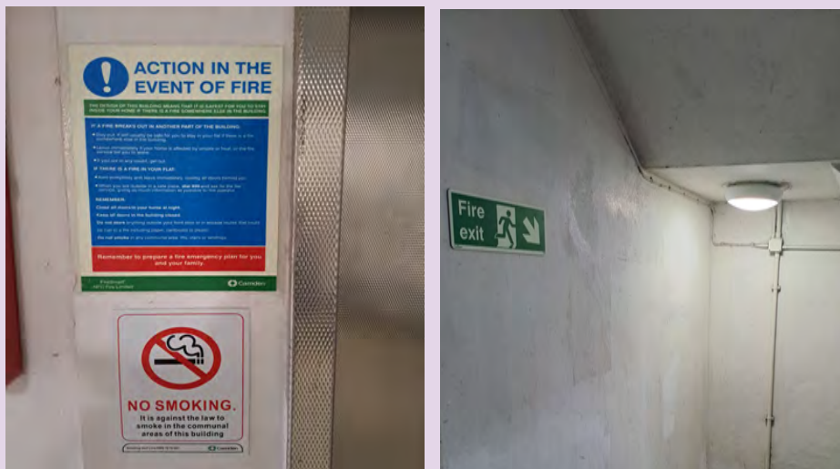
Fire Action Notice and Fire Exit Sign at Faversham House.

We have installed Fire Action Notices and Fire Exit Signs in your building.