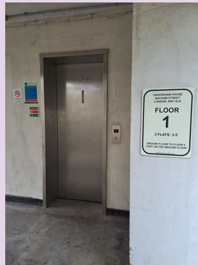
Wayfinding signage at Faversham House.

Wayfinding signage is a visual communication tool to assist the Fire and Rescue Service in locating specific flats as they navigate their way round a building.