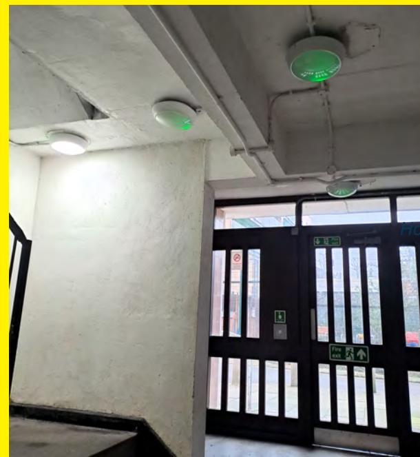
Emergency lighting at Faversham House.

The lighting should illuminate all escape routes, emergency exit/s and firefighting equipment.