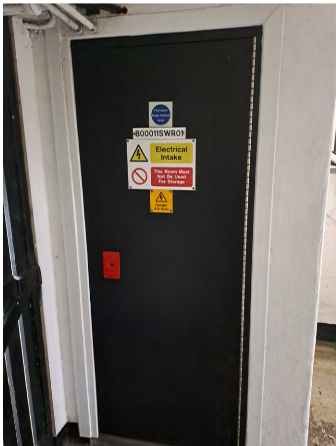
Electrical Intake Cupboard Fire Door at Faversham House.

Doors to plant rooms, electrical intake and lift motor rooms (including fire rated hatches or panels)